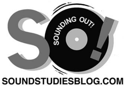
FIGURE 4.8 A greyscale version of the SO! logo (created by artist Dan Torres), which is emblazoned across all our platforms.

emailer that goes out to more than 1,100 subscribers—has its own conventions, protocols, and even audiences, and it took much brainstorming, trial, and error, to discover how to reach out effectively. Our respondents underscored this point as they shared how they connect with us on many social media platforms. As we played around with different social media profiles, Sounding Out! held fast to two main concerns: legibility and accessibility. We wanted to ensure that interested parties at each access point in Sounding Out! 's constellation of social media would immediately recognize our “digits” at work yet would also find unique information and conversations there. Such diffusion, we felt, would enable more mobility for the sound studies community—not being housed or affiliated with any one virtual location—and offer an increasingly diverse range of ways for interested parties to feel connected, share information, join conversations, reach out to each other, and spread the word through shares, likes, retweets, reblogs, “+1s,” and up-arrows.