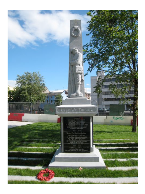
Figure 3: The Cork City War Memorial