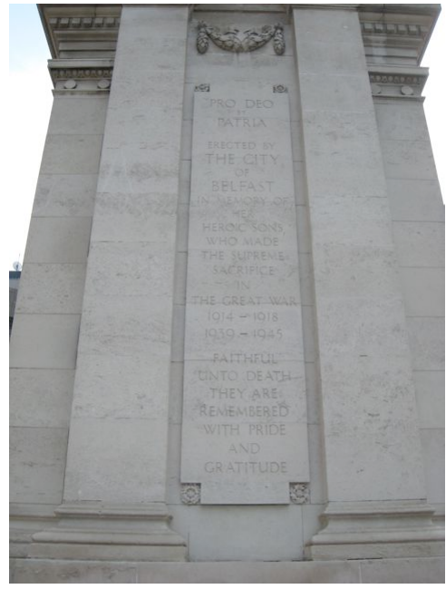
Figure 5: Belfast City War Memorial Garden (left) and cenotaph inscription (right).