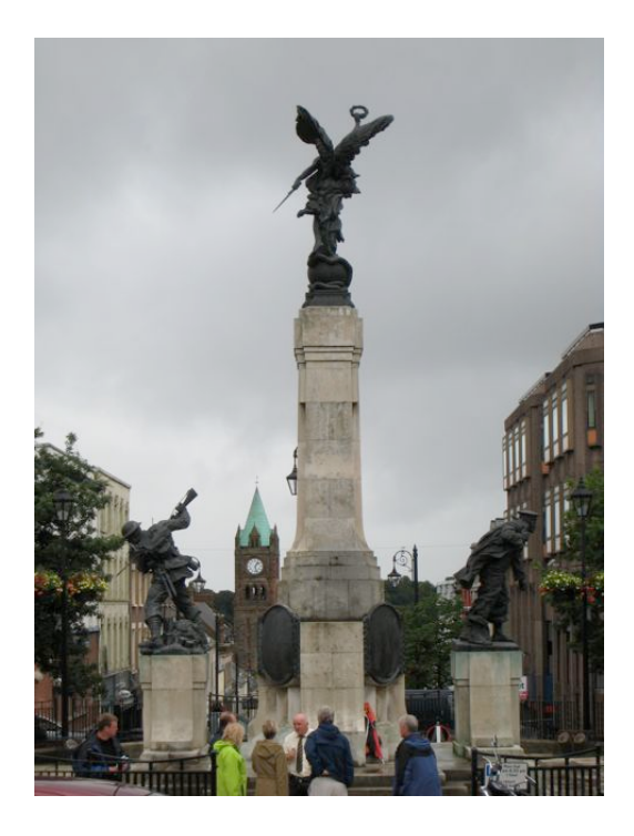
Figure 4: The Diamond War Memorial, Derry from the front (left) and the back (right).