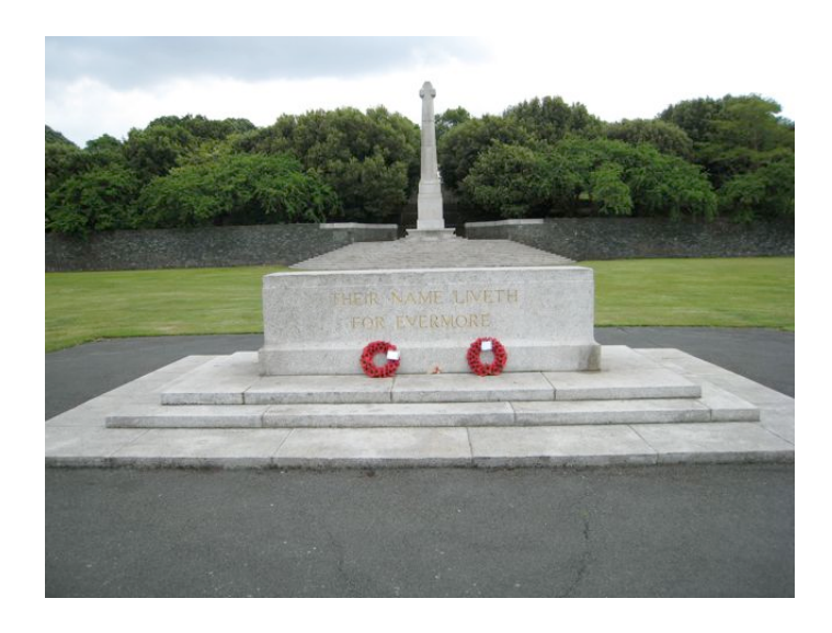
Figure 1: The Stone of Remembrance and Cross at the Irish National War Memorial, Dublin.

Office of Public Works, the Irish National War Memorial was allowed to fall into a state of disrepair for a significant portion of the twentieth century.