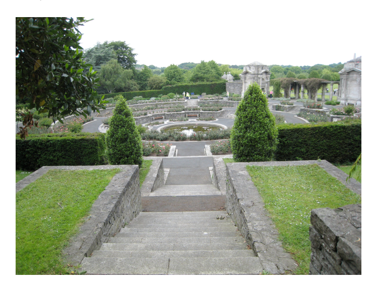
Figure 2: One of two sunken gardens at the Irish National War Memorial, Dublin located at the east and west ends of the main park.