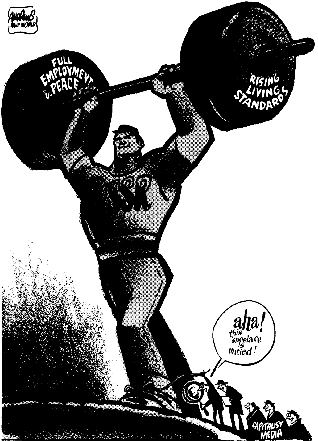
Cartoon from Daily World, February 18, 1977