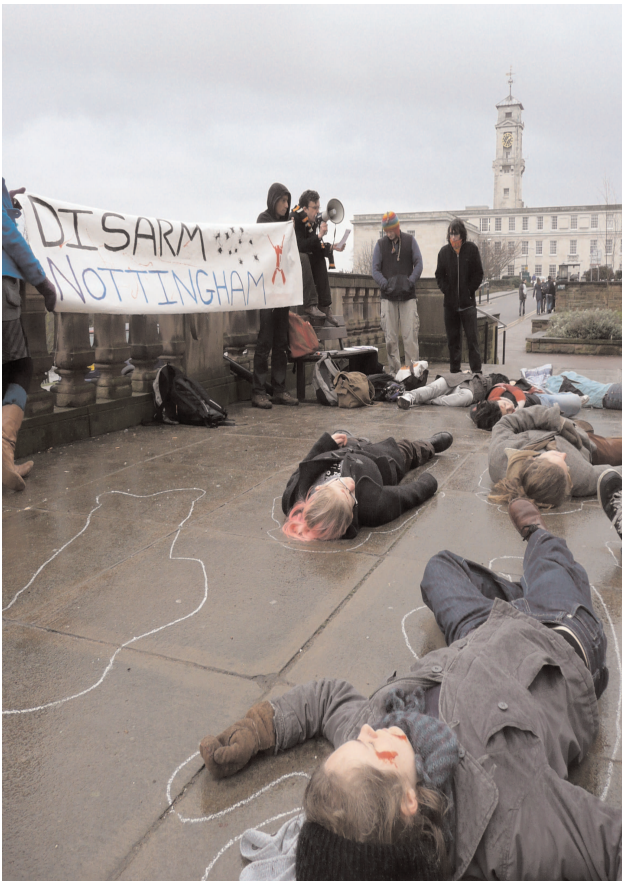
Disarm Nottingham hold a die-in

You can write your own press release or adapt a draft one which can be downloaded from the student wiki at http://wiki.caat.org.uk and send it out to local and student media.