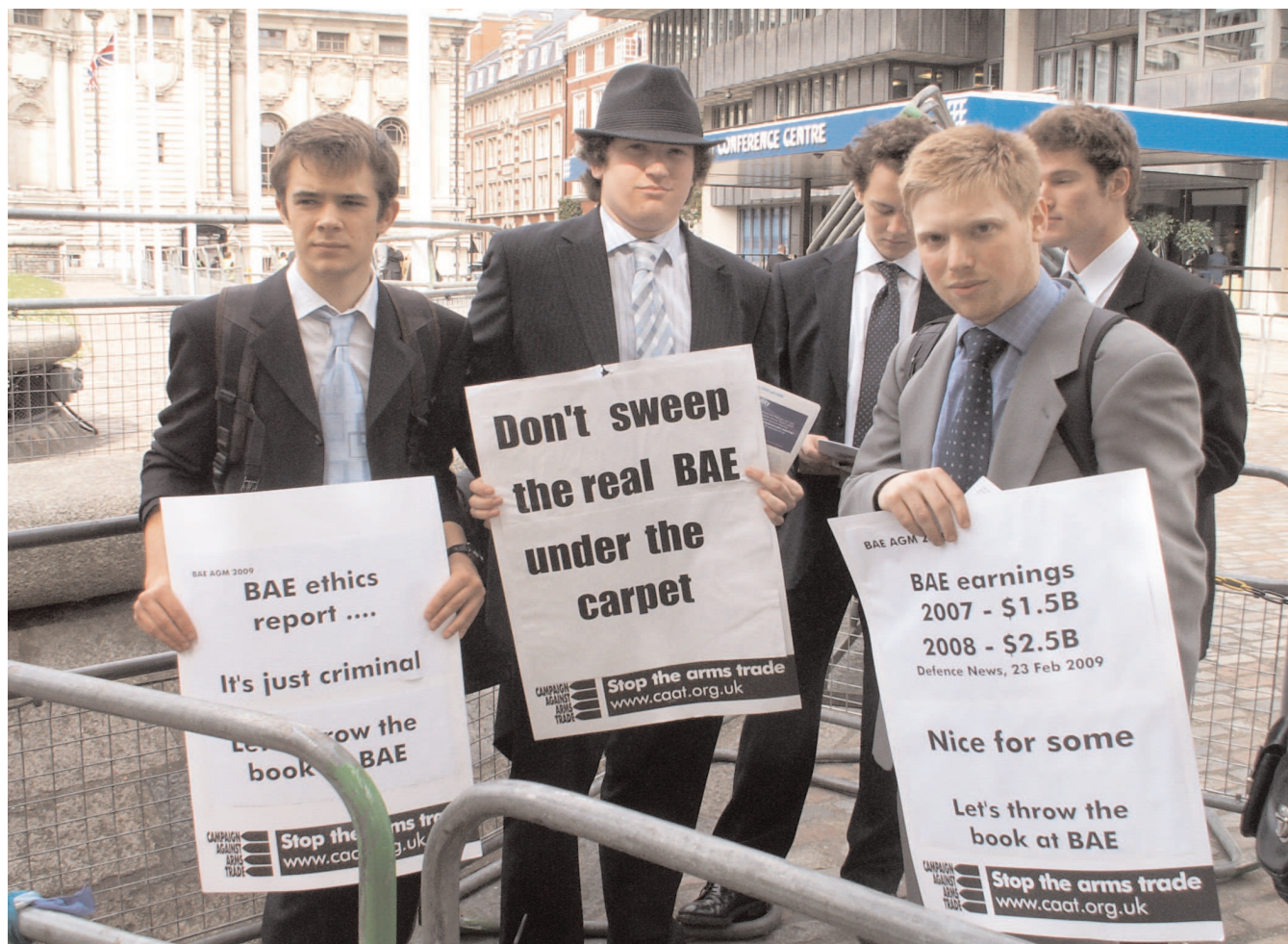
Students highlight the problems with companies like BAE Systems

This is often the response to a question along the lines of 'Does it not bother you that the weapons your company sells results in the deaths of civilians?' Note that they will avoid answering the question, so make sure they do. Cars are not tools specifically designed to kill people and are designed to maximise safety, and when they do kill people it is not the intention. Weapons on the other hand are designed to kill, maim and destroy and have no other function. It is not the same at all.