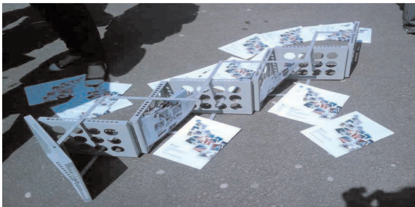
The remnants of the stall after students had intervened

Back in the park, we recycled the leaflets, distributed the complimentary mugs amongst ourselves, and nominated someone to send a press release with photographs to the student newspaper.