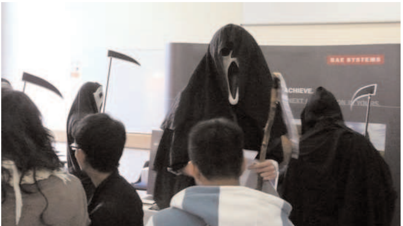
The grim reapers strike again at a BAE Systems stall

NB: Some of these actions may have more serious legal implications than others. See page 9 for more information on legal issues.