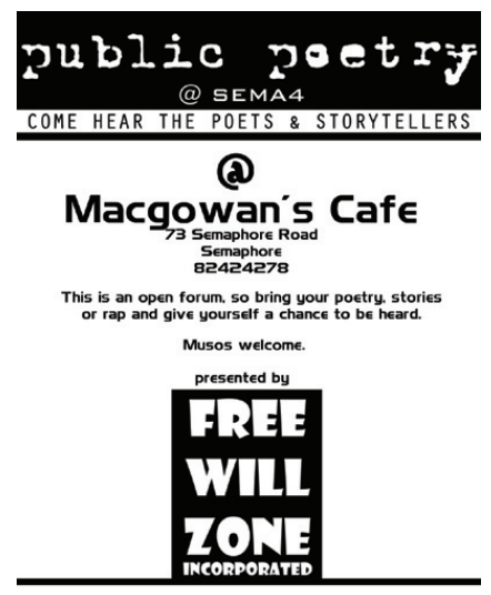
OPENING NIGHT TUESDAY 8-8 @ 8PM-10PM & EVRY TUES NIGHT THEREAFTER

28 September - 2 October NYWF is looking for ideas for events – performances, forums, workshops, debates - from young writers for the 2006 festival in October in Newcastle, NSW. Submissions are officially closed, but it's still worth contacting the festival to see if events are looking for readers or participants ... For further information on movements with the NYWF and TINA visit http://www.thisisnotart.org/