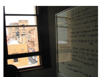
The White Board, filled with ideas.

SA Writers' Centre Events Program April – July 2007