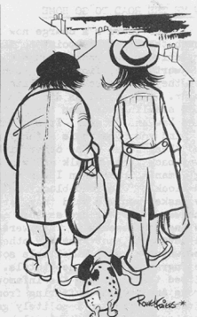
"It's a funny world, where toilet rolls increase in value and the poor decrease."

The Receiver insists that the factory is not going to close yet the workers have been asked to clear off all the close on the books with a promise of a £25 bonus which sounds like a very poor pay off. Prodan and Tools and Cans has been in existence for just three years and during that time has received nearly a quarter of a million pounds of public money, which the workers didn't see too much of. The bank will not lose out as it can sell off the stock and machinery, as usual, the only losers are the workers and the public whose money was spent. The workers have demanded that Don Concannon, Minister of State for Industry, come to meet them and explain where the public money went to. So far there has been no response to this demand. The workers and local Trade Unionists should also demand that the factory remain open under state control and that the German owners be made to pay back the vast sums of money they have squandered.