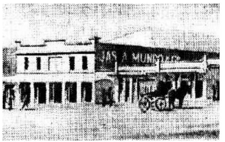
View of the Therry Street shops in 1913.

If the archaeologists find artefacts of significance, such as individual objects or evidence of previous buildings, they will document their discoveries. The investigation are expected to be complete by April and a report will be provided if anything is revealed.