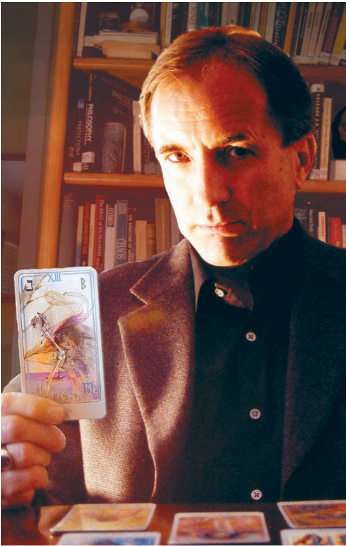
Michael Shermer prepares for his debut as a “Psychic for a Day.”

We have also included information from other articles published by the Skeptics Society, most notably Michael Shermer's “Psychic for a Day: How I Learned Tarot Cards, Palm Reading, Astrology, and Mediumship in 24 Hours” written after his appearance as a ersatz psychic on Bill Nye's adult oriented PBS science series Eye on Nye in 2003, and posted on our website ( www.michaelshermer.com/science-friction/excerpt/ ). In it, Shermer answers the question, “Do you have to master the details of the fortunetelling arts, or are they only window dressing for the more down to earth techniques described in this booklet?” With only 24 hours to master palm readings, tarot card readings, astrological readings, and even talking to the dead, Shermer had no problem convincing subjects that he had never met that he was psychic. The fact that he could perform reasonably well with only one day of preparation shows just how vulnerable people are to these very effective psychological manipulations.