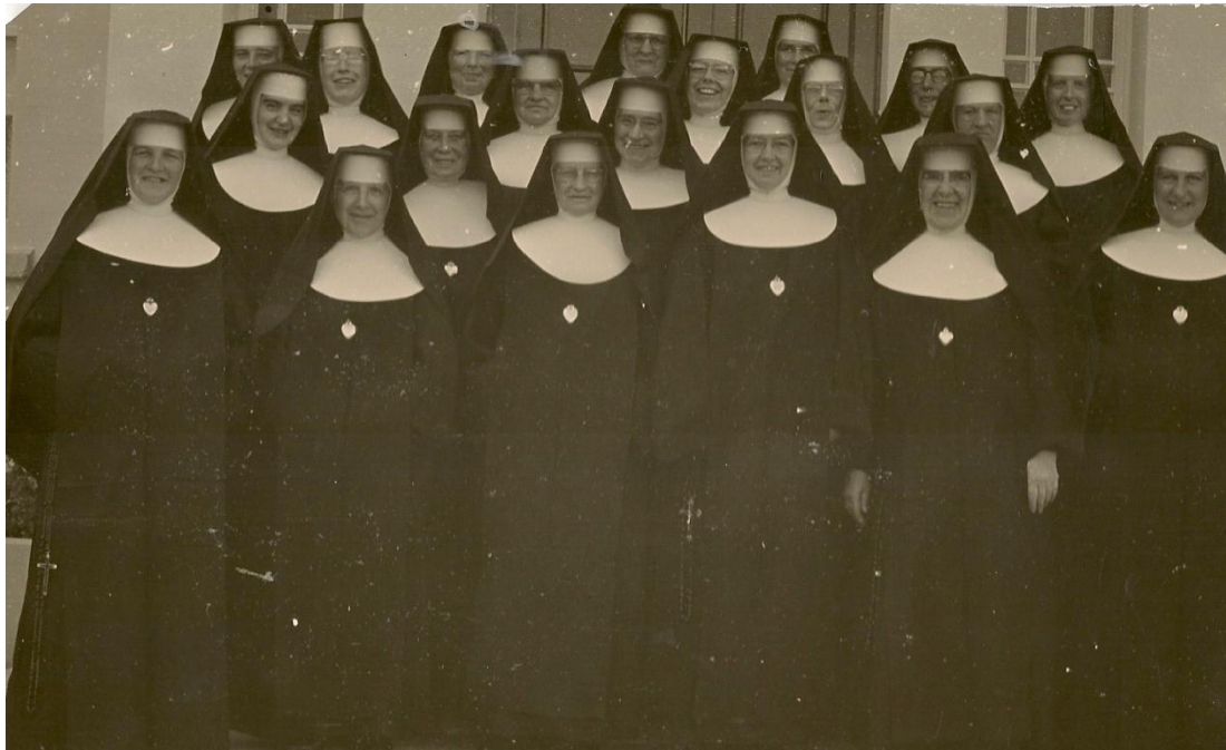
Paulstown and Gorebridge communities, county Kilkenny