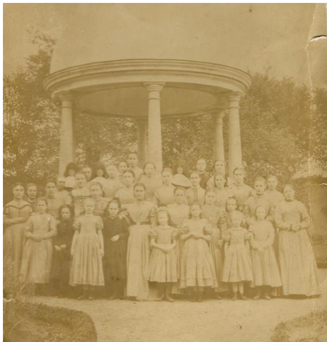
Boarding School pupils, Tullow, county Carlow, c 1860

Extract from register of the National School, Tullow, county Carlow, 1901-1902