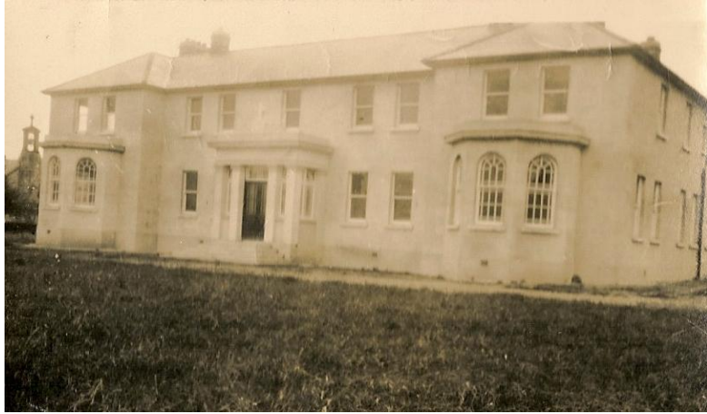
Paulstown Convent, county Kilkenny, 1932