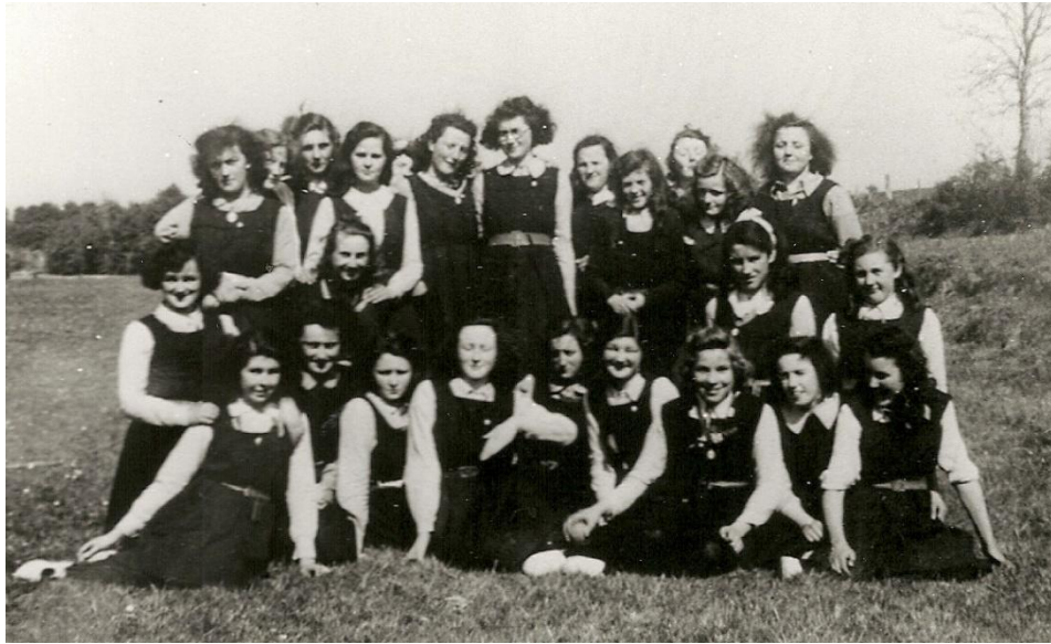
Pupils, Abbeyleix, county Laois