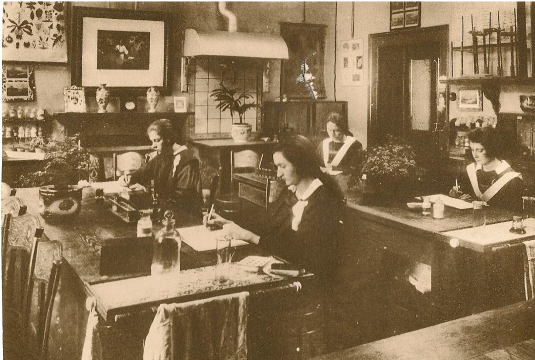
School laboratory, Goresbridge, county Kilkenny