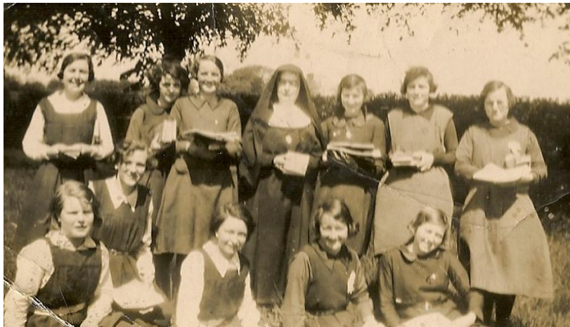
Group at Tullow, county Carlow, 12 May 1935