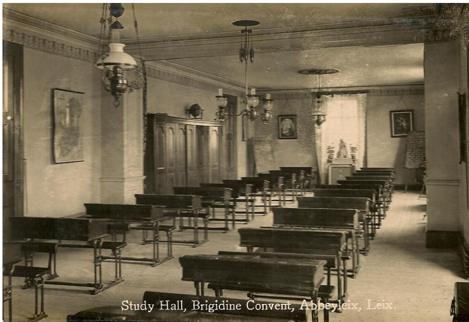
Study hall, Abbeyleix, county Laois