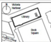
Location Second Floor