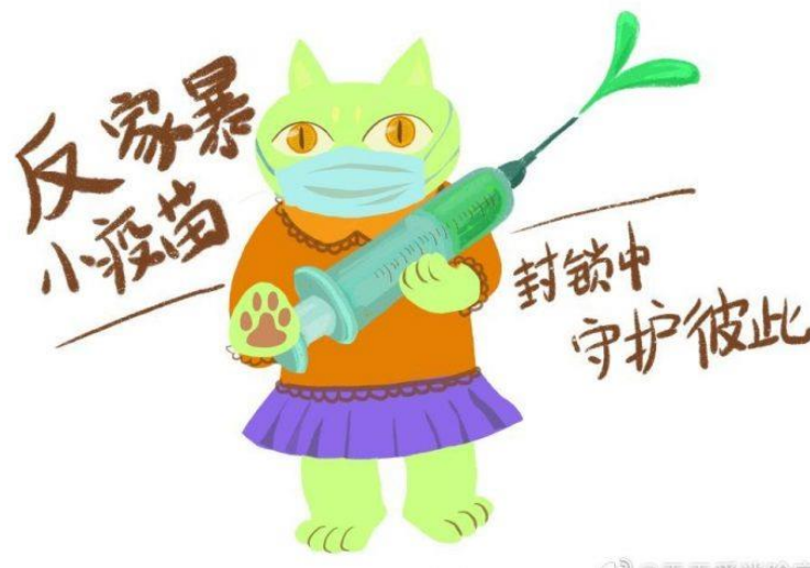
Figure 4. 'Anti-Domestic Violence Little Vaccine' campaign logo