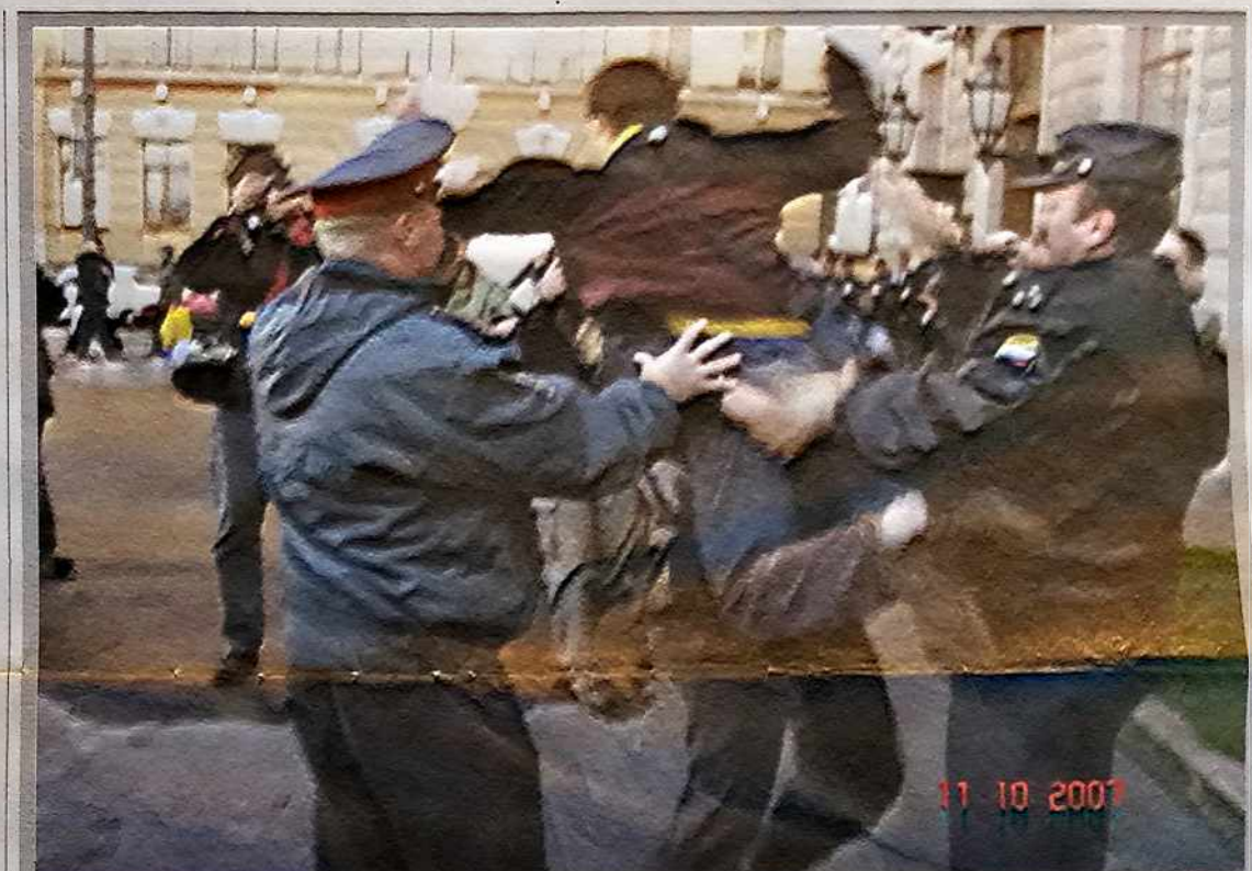
NUKE DUMP TACKLE: A protester is detained in the antiatomnoy action in Pieter on 11 October. The action was protesting against the docking of a ship carrying large quantities of nuclear waste from Europe to be dumped in Russia. Putin's government have been selling the right to dump nuclear materials on the Russian people to European nuclear powers.

Despite this, PFI companies have consistently undercut public sector 'bidders' in contract negotiations, thanks to a mechanism where public