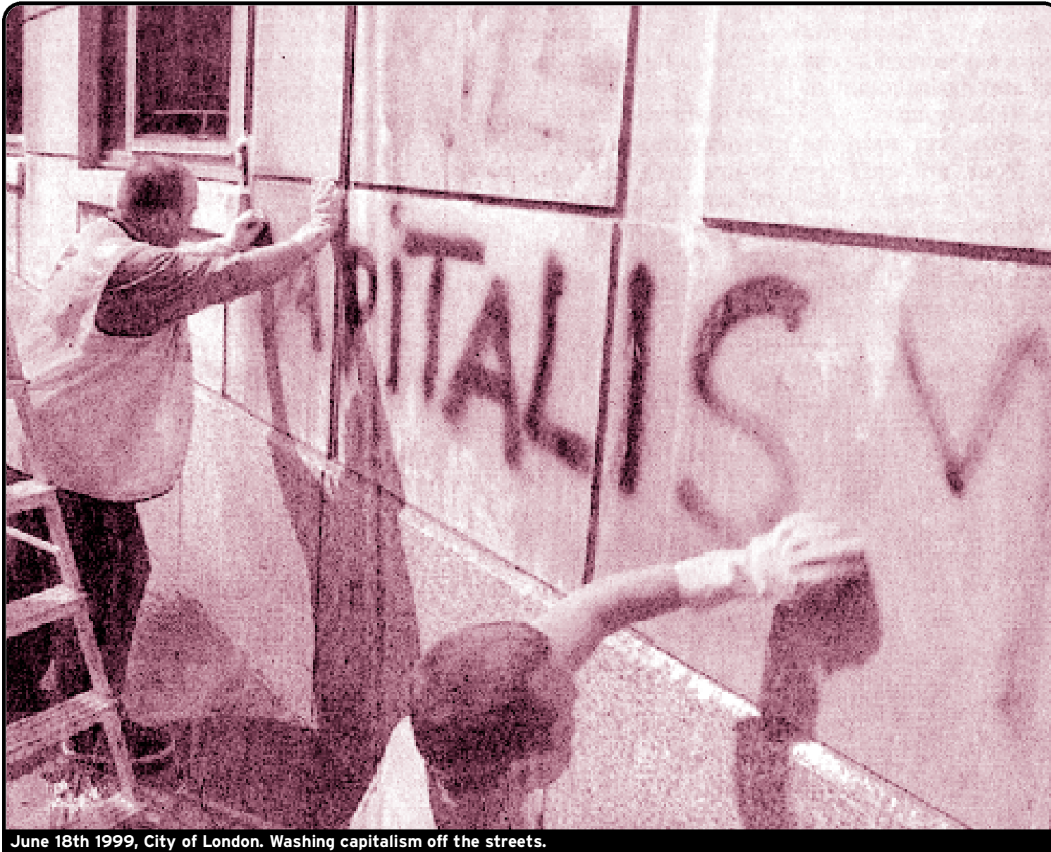
June 18th 1999, City of London. Washing capitalism off the streets.

"They never knew what hit them. They had assumed it would be business as usual, the way it had been for decades. Rich men gather, meet, decide the fate of the world, then return home to amass more wealth. It's the way it's always been. Until Seattle."