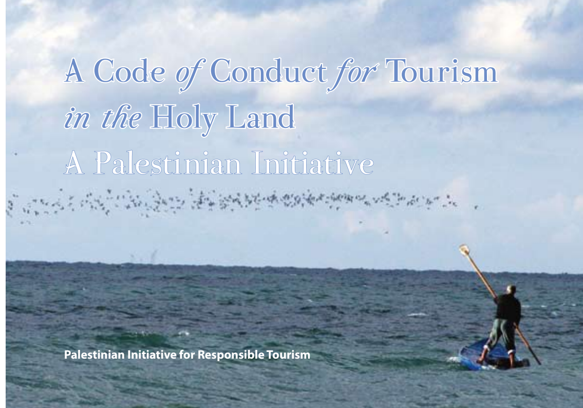
Palestinian Initiative for Responsible Tourism