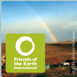
The village of Om Elkheir.