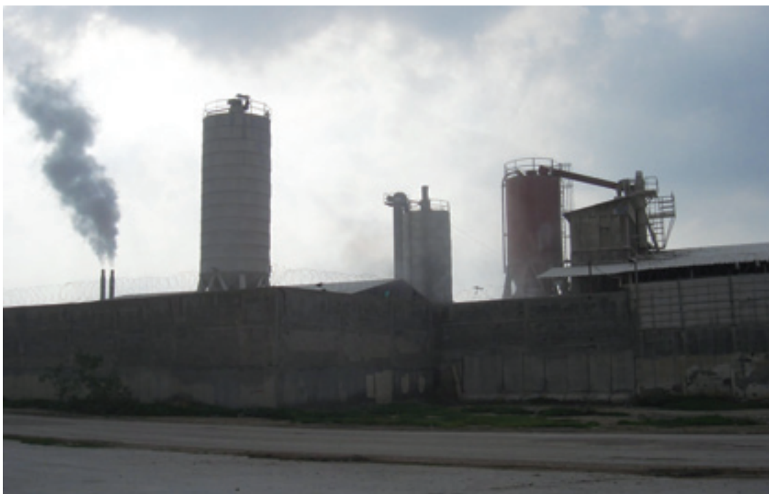
Chemical plants near Tulkarem.

The FoEI delegates were not able to speak to any of the workers or a representative from the workers’ association, but when Corporate Watch interviewed workers in 2010 they were told that Palestinian trades union officials were prevented from entering the site. Deductions from the workers’ wages are paid to Histadrut, the Israeli organisation of labour unions which refuses to support Palestinians working in the Nitzanei Shalom industrial estate, and workers involved in actions to improve wages and conditions are victimised.