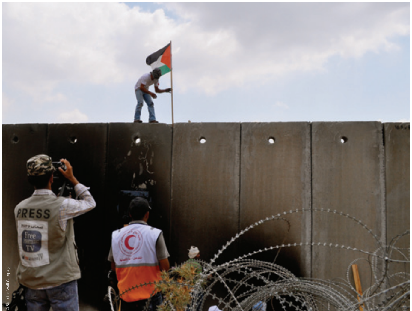
Young man flies the Palestinian flag on top of the separation wall at the beginning of a demonstration in 2009.

Thus the construction of the apartheid wall may also be seen to constitute an environmental crime as it has destroyed hundred thousands of acres of Palestinian cultivated land and uprooted or destroyed thousands of trees, and eradicated wild plants and ecosystems, in addition to the expropriation of fertile surface soil, which was excavated and taken out of the occupied territories.