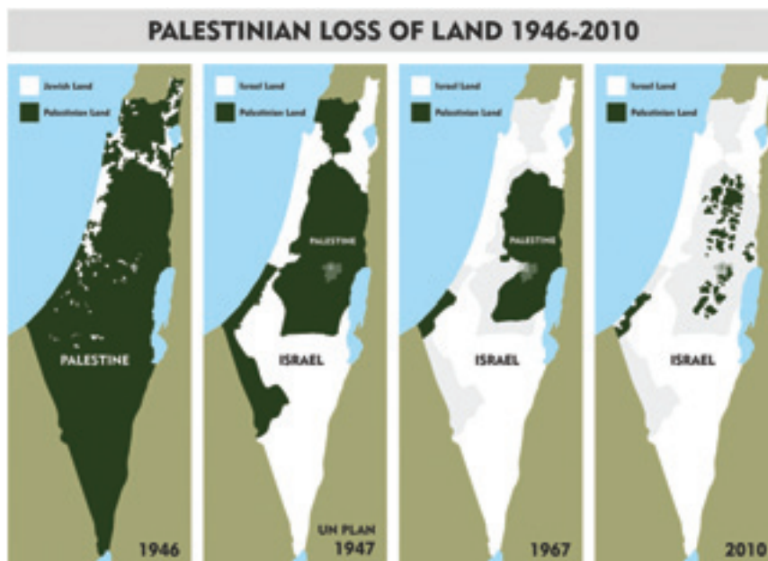
PALESTINIAN LOSS OF LAND