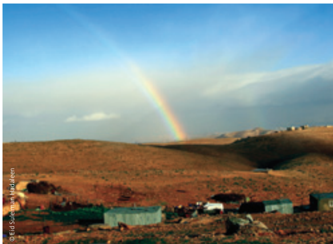
The village of Om Elkheir.

Since the occupation, the colonial settlement of Karma'el has grown and surrounded Om Elkheir with residential blocks and poultry factory-farms. Israel provides Karma'el with access to the water supply network whilst the Palestinian Water Authority is prevented from providing network access for Om Elkheir and prohibits the construction of cisterns. As a result, settlers have access to 89 percent of the water, and use 300 litres per person per day, compared to the Palestinians' 15 litres, which is transported by donkeys and carried on women's and children's heads from long distances. The water pipes which conduct the settlers' water pass through Om Elkheir's land.