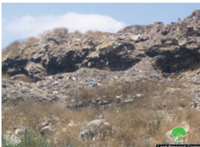
Dumping site near Qalqilia.

There is also documentation of hazardous waste being smuggled into the West Bank from Israel for illegal dumping, and the occupying military forces dumping highly toxic and nuclear waste in the occupied territories (Isaac and Hilal, 2011).