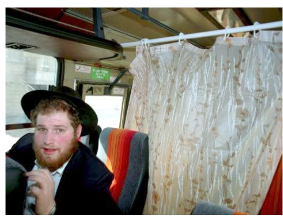
Women hidden in a segregated bus

based on local custom is still very much alive, this time in Israel. In a recent Forward editorial, our attention is called to the efforts of women like Naomi