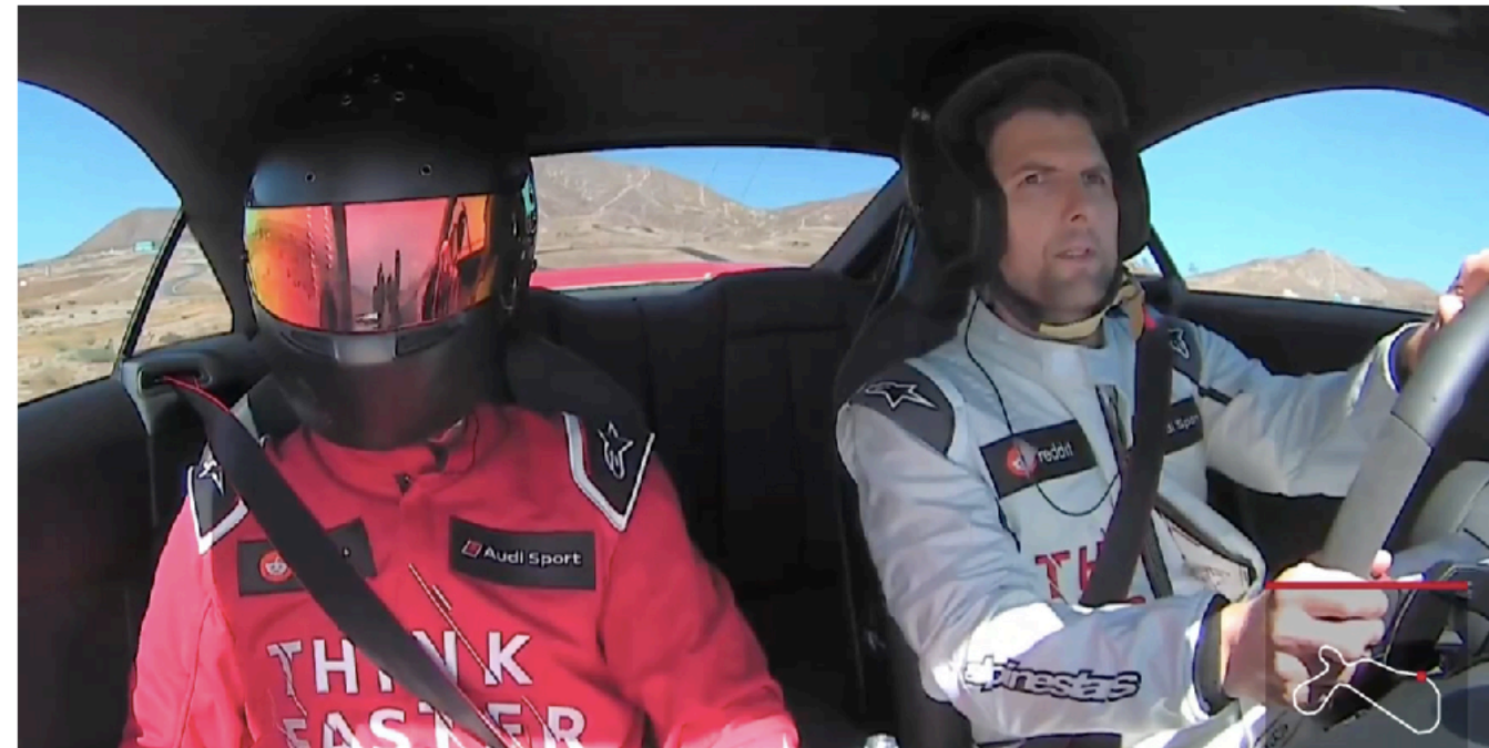
Adam Scott took questions on his favorite co-stars and memorable moments while navigating a race course.

Adam Scott and Elizabeth Banks Took Questions From Reddit While Driving an Audi at 115 MPH