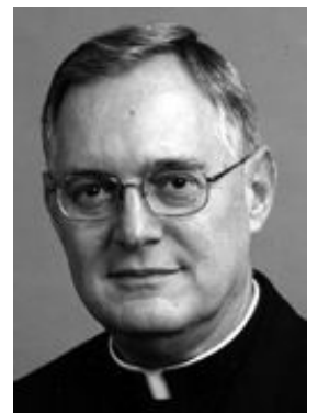
Bishop says YWC goes "against church teaching."