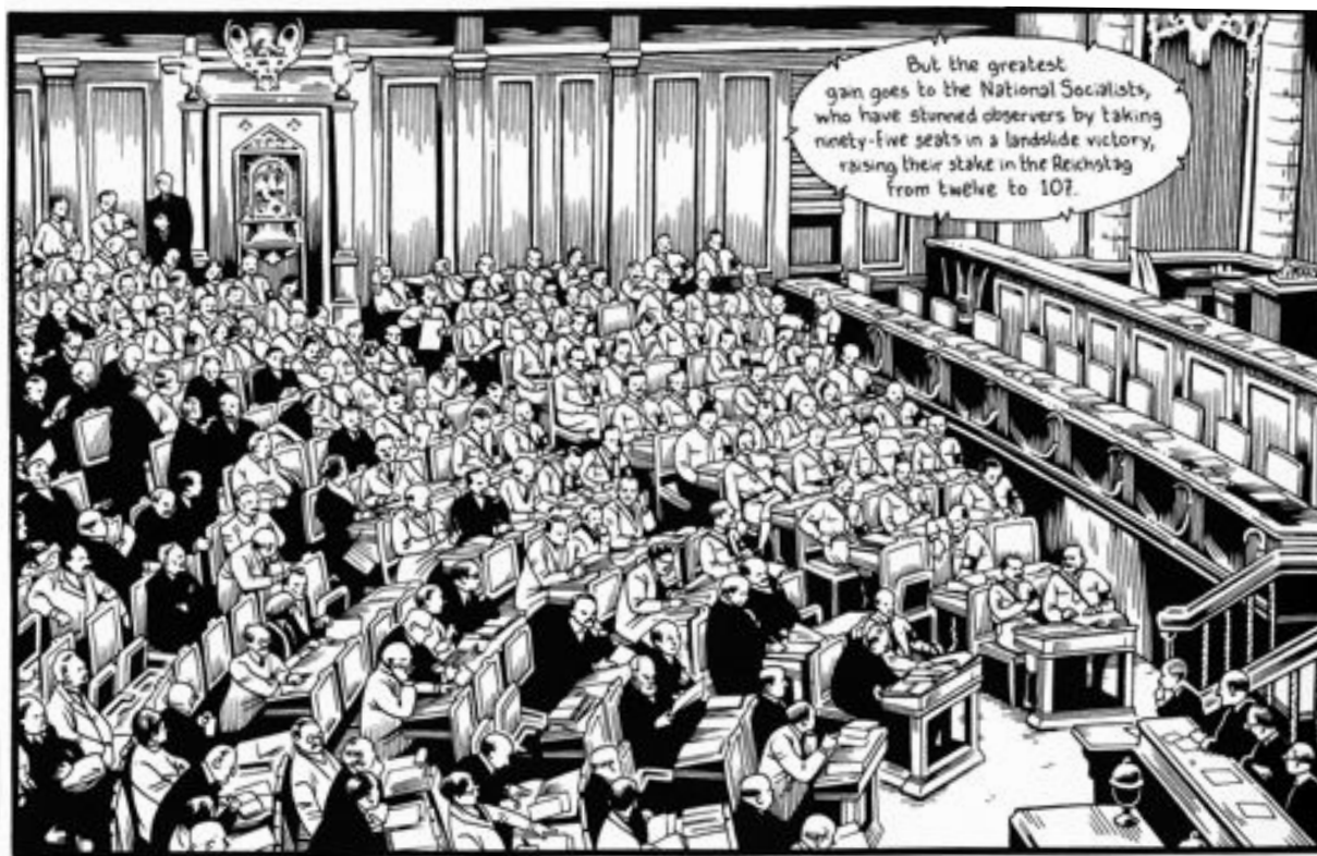
Fascists in Spain, Germany and Italy, as well as the more recent anti-immigrant parties in France and the UK, have all used a combination of legal political activity as well as violent attacks against immigrants, ethnic minorities, queer people, and radical opposition.

So let us be clear on at least one point: white supremacy is not an “idea” that can be peaceably debated in a bubble on campus. It is a pre-existing reality, maintained through violence every day in this country. The sooner we realize this, the sooner we can dismantle the racial hierarchies that haunt this country.