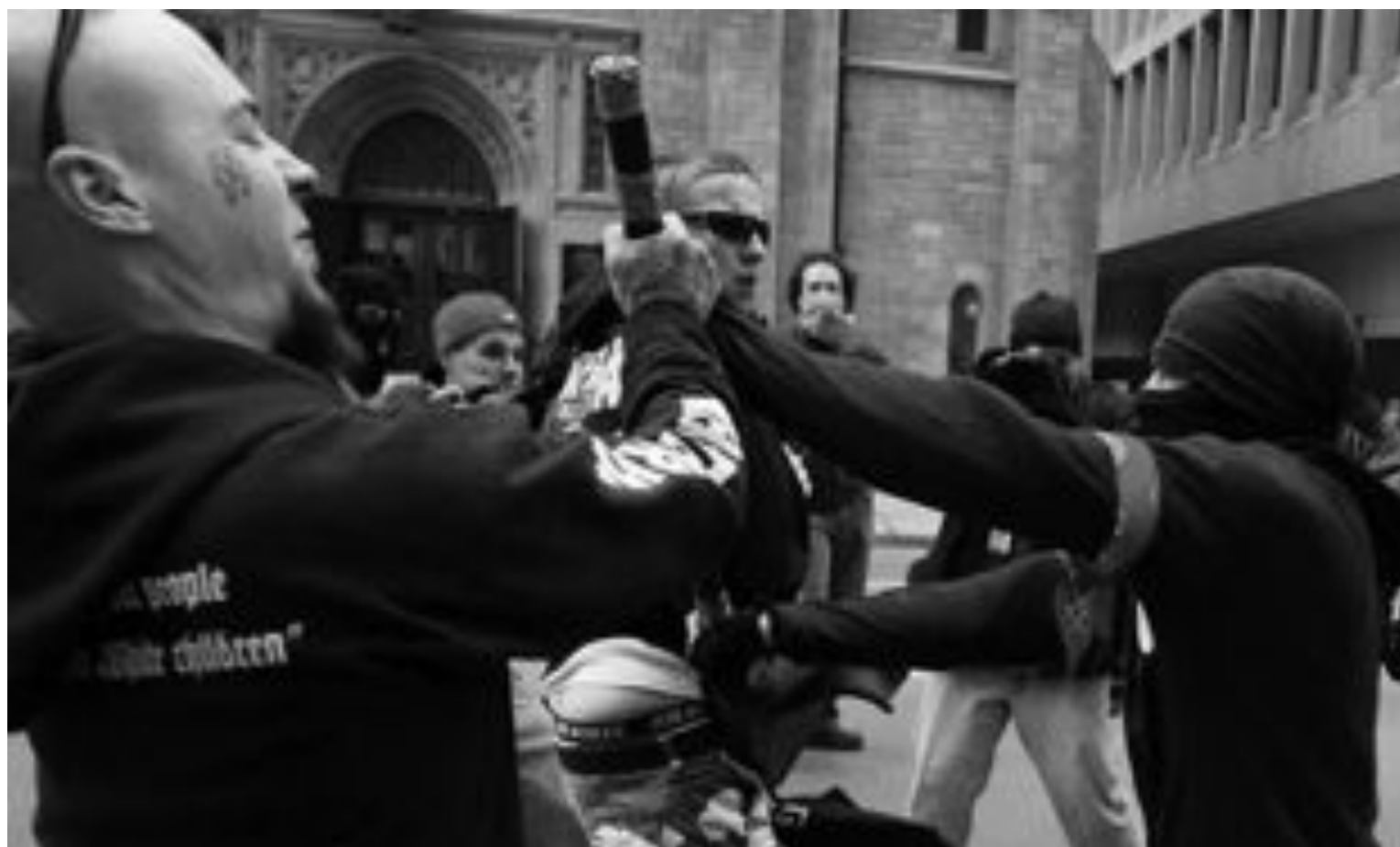
(Top) Anti-racists clash with the Aryan Guard in Calgary, Canada. Both the Aryan Guard and Youth for Western Civilization are heavily supported on white supremacist websites like Stormfront.org.

Regardless of the reasons for Providence College's decision, it represents one more blow against an organization surrounded by controversy, criminal charges, and accusations of white supremacy.