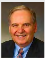
Norman L. Geisler

B.A., Cedarville University; Th.M., Th.D., Dallas Theological Seminary