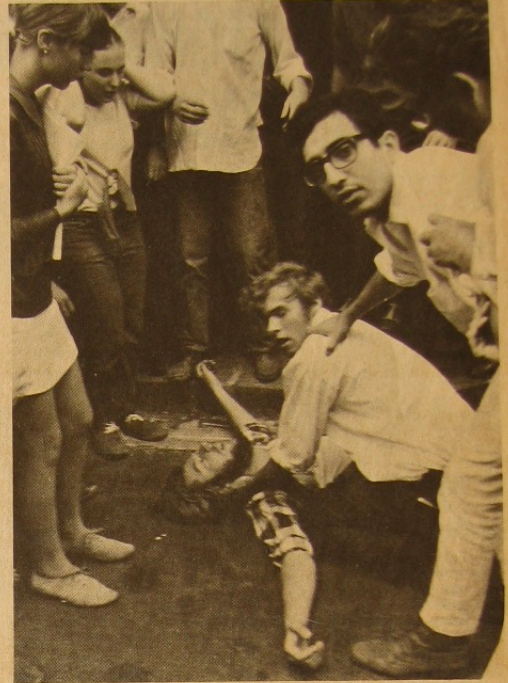
UNIVERSITY STUDENT FELLED