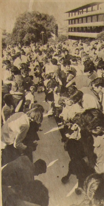
SIGNING ANTI-CONSCRIPTION PETITION

It was the second such demonstration by students in Sydney this year; if anything, this march was numerically smaller than the first, held early in March, when police made very few arrests.