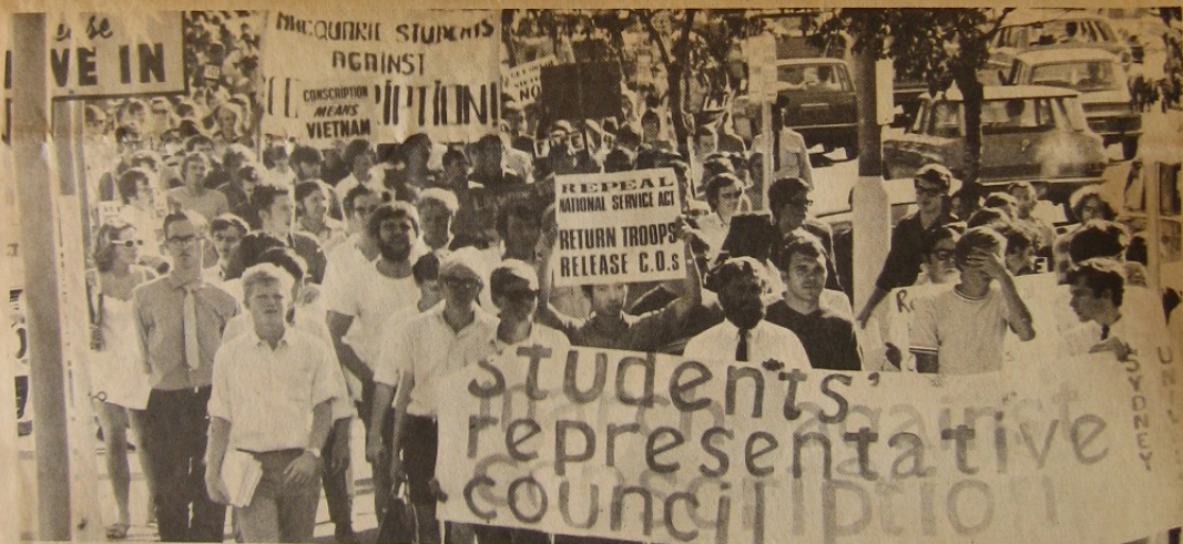
BELOW: STUDENTS MOVE ALONG PARRAMATTA ROAD TO CITY