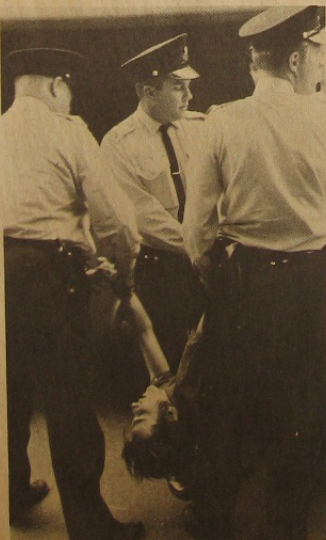
BELOW: The dignity of man.