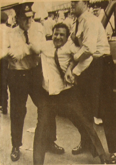
TRADE UNION OFFICIAL SEIZED