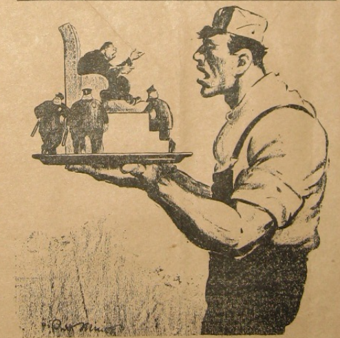
If He Only Knew?

THE VOTER. Into the polling place, and why not know him, Nor whence, like water, willy-nilly, flowing, And out again, when he has made his Cross, Back to his fruitless, ill-paid labor going. He, in his youth, did eagerly frequent Old party rallies, heard great argument, About the Robber Traffic, and the Trusts, And come away, no wiser than he went. With them the seed of Piffle did sow, In hopes of some cheap job, helped make it grow. And this is all the Working class has reaped— Their efforts help their leaders get the Dough.