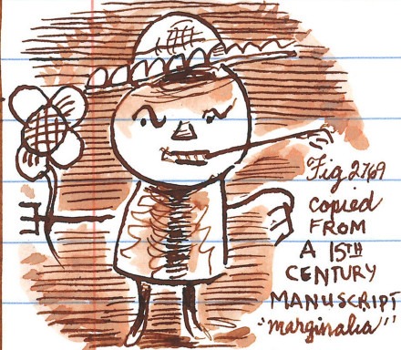
Fig. 2769 COPIED FROM A 15TH CENTURY MANUSCRIPT "marginalia"

MY GOAL IS MORE ROCK LESS TALK FROM THE FIRST DAY ONWARD. IN THIS CLASS WE COMMUNICATE WITH IMAGES.