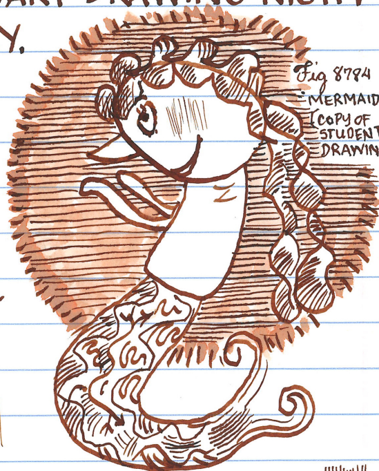
Fig. 8794 "MERMAID" COPY OF STUDENT DRAWING

I GIVE THE CLASS A SHORT, SIMPLE LESSON ON HOW TO DRAW A FIGURE IN THE STYLE OF IVAN BRUNETTI AND THEN WE BLAST OFF ON AN EXPEDITION THAT WILL LAST THE WHOLE SEMESTER.