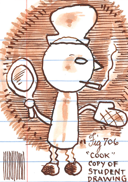
Fig. 706 "COOK" COPY OF STUDENT DRAWING

THERE IS AN ENERGY ON THE FIRST DAY OF CLASS - DREAD AND HOPE COMBINED - AND I DON'T WANT TO WASTE IT ON INTRODUCTIONS OR TALKING ABOUT THE CLASS, WE START DRAWING RIGHT AWAY.