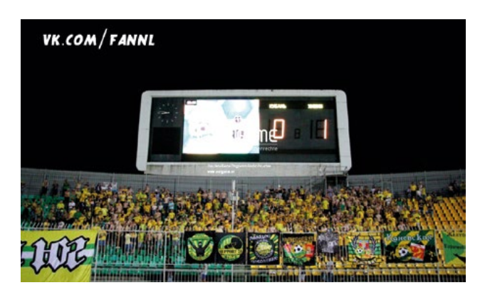
July 18 : During the match between Dinamo Moscow and Spartak Moscow fans of Dinamo displayed a homophobic banner reading "Hello, pigs. Slaves of the gay". On July 20, the RFU Disciplinary Committee fined Dinamo RUB 25000 for 'displaying an unauthorised banner'.

July 15 : During the match between FC Kuban Krasnodar and FC Khimki, Krasnodar fans displayed a banner reading "Korenovtsy" in runic letters including the Odal rune.