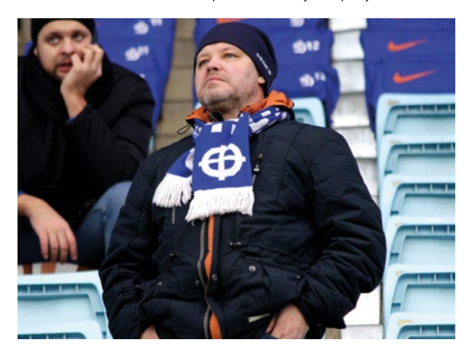
April 9 : At the CSKA v Dinamo Moscow derby a CSKA fan displayed a T-shirt reading "Moscow brigadiers" in runic letters featuring the Odal rune.