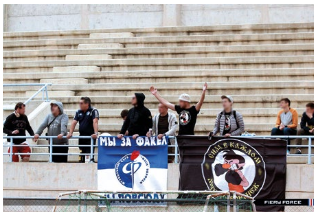
February 28 : A "Tosno White Boys" banner referring to "white heritage" was displayed in St. Petersburg at the Russian Cup match between FC Tosno and Luch-Energiya.