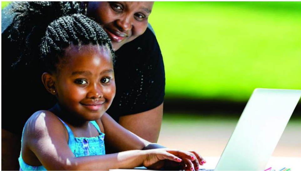
Parents can provide the attention and time that most schools cannot

LinkedIn Twitter G+ Google+ Facebook 28 Email COMMENTS