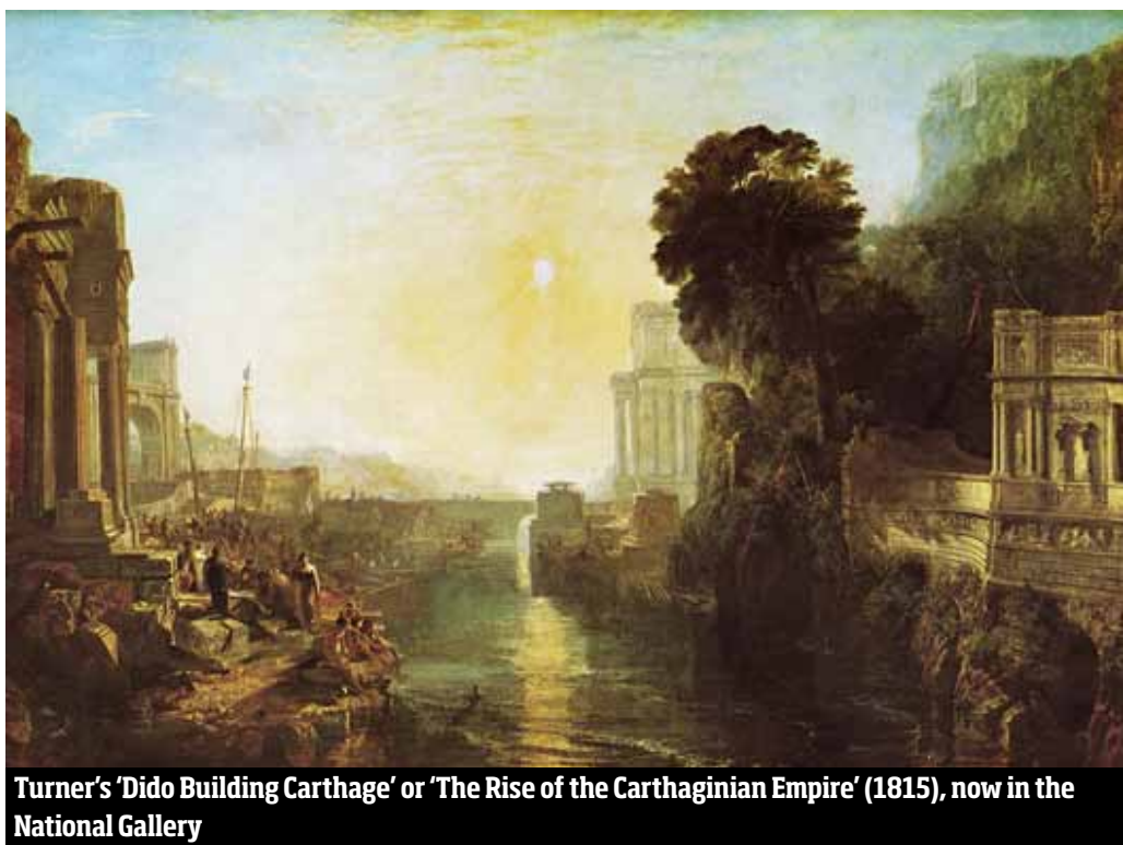
Turner's 'Dido Building Carthage' or 'The Rise of the Carthaginian Empire' (1815), now in the National Gallery

The daily life of the artists was brought alive with the mention of