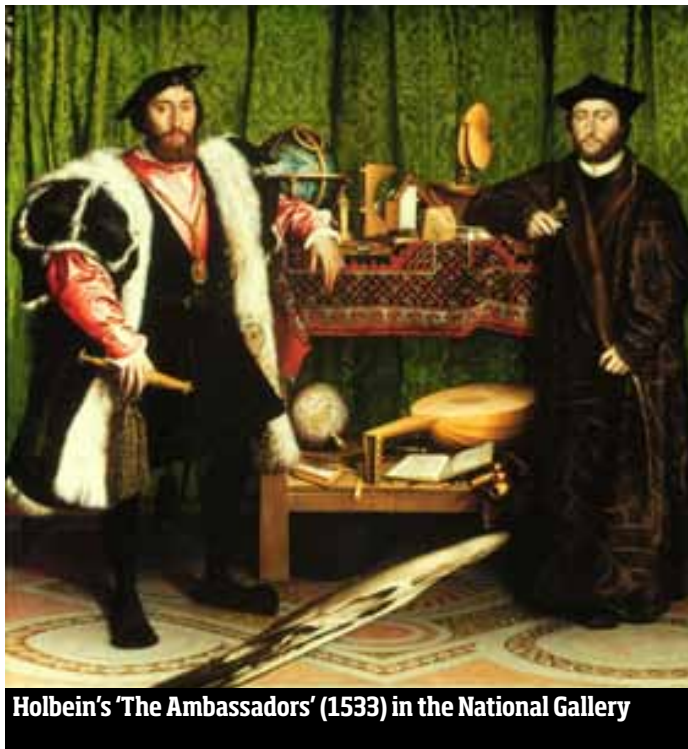
Holbein's 'The Ambassadors' (1533) in the National Gallery

In Maiden Lane we met the son of a barber, Joseph Mallord William Turner (1775-1851), a smart man with money. He was also very clever in ensuring that his memory lived on by keeping his best work, buying back some pieces, and then bequeathing it all to the nation. He considered 'Dido building Carthage', or the 'Rise of the Carthaginian Empire' his masterpiece, suggesting that he was to be buried in it, but in the end bequeathing it to the National Gallery