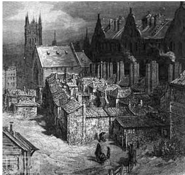
Illustration above is by Gustave Doré (1872) and shows the small, multi-occupancy houses fronting onto Old Pye Street during the time that slum clearance of the area was underway. The Palace of Westminster is in the background.

THE IDEA OF RAGGED SCHOOLS began in Portsmouth in 1818 when a cobbler called John Pounds took to teaching poor children free of charge. Initially ragged schools were set