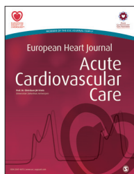
European Heart Journal: Acute Cardiovascular Care