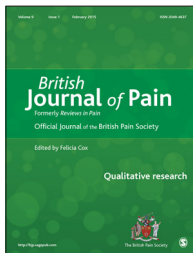
British Journal of Pain