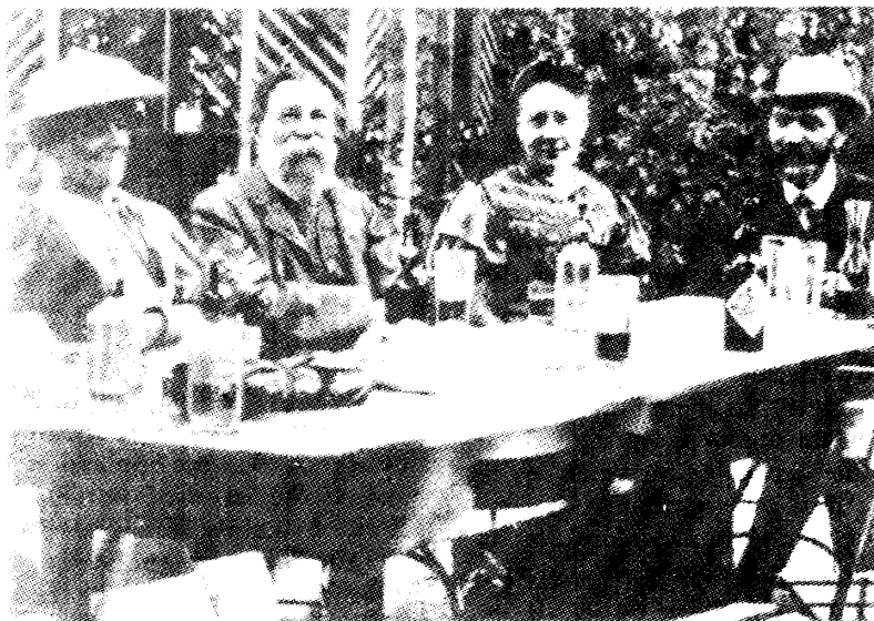
Clara Zetkin (left) with Frederick Engels at her side and August Bebel during the International Socialist Workers' Conference, Zurich, 1893

Eleanor Marx and Edward Aveling's pamphlet The Woman Question continued in the same vein of identifying the "social struggle" (against capitalism) and the struggle for women's equality as parallel movements, not as aspects of the same movement. Nor did they make much progress toward bridging the