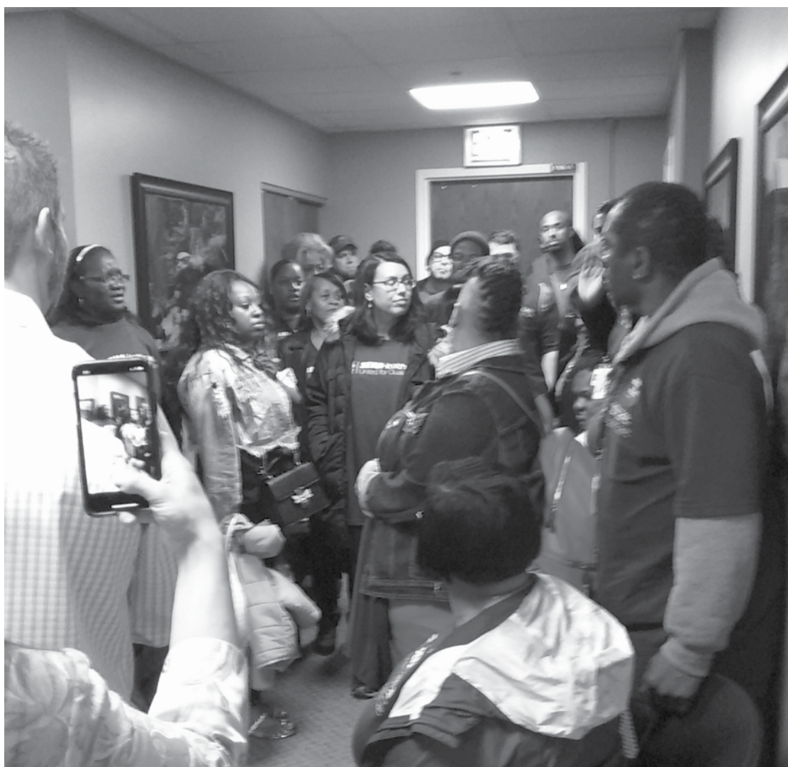
Mount Sinai hospital workers in Chicago occupy office of racist CEO