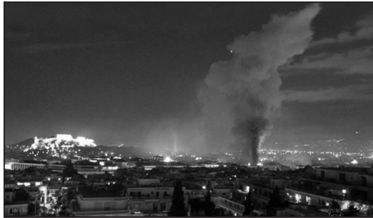
Plumes of smoke rise from buildings burning below the Acropolis.

Banks were burnt all night. The police were knocked off their motorcycles with ropes strung across the roads, the city hall of Athens was occupied by anarchists, smoke rose high into the air, and hundreds of