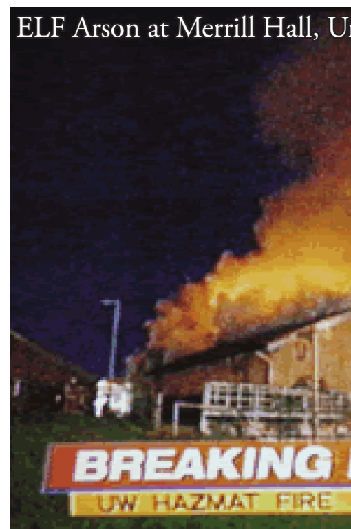
ELF Arson at Merrill Hall, U

Shortly after this, ten members of the cells decided to stage a double hit against two targets in different states on May 21st, 2001. One would be the Jefferson Poplar Farm in Clatskanie, Oregon, while the other would be the UW Horticultural Center in Seattle. The former was chosen because it was believed that genetically modified trees were being grown there. The latter was chosen because a specific professor had his offices in the building and because he conducted genetic research on poplar trees.