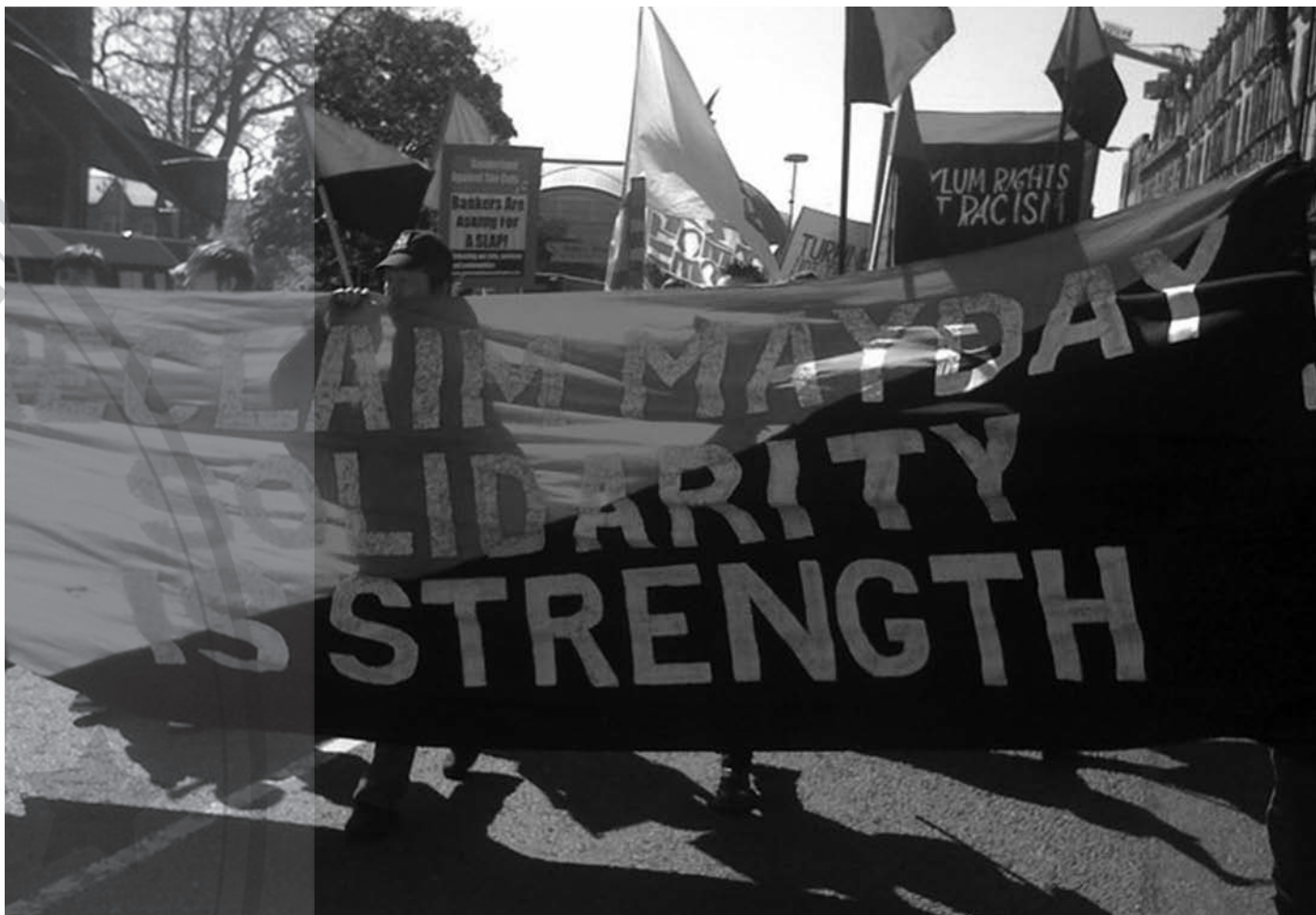
North East Anarchists marching through Newcastle on Mayday 2011.

enabling effective protest, class struggles, genuine cooperation and progress. Not by flogging people dead ideologies and worthy but limited and ineffectual sectarian politics. We all need to get to know each other and maybe we can surprise ourselves at just how many of us there are when we're gathered in one room.