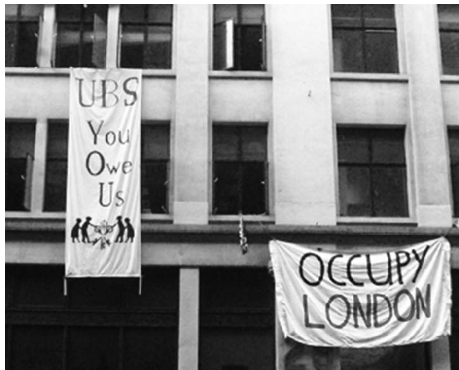
The newly opened 'Bank of Ideas' in Sun Street, London, after the public repossession of an abandoned office block owned by bankers UBS. See http://www.bankofideas.org.uk/

Overall though 2011 has given us glimpses of our potential. To all Freedom readers, enjoy the remainder of the year and we will see you recharged and ready for 2012.