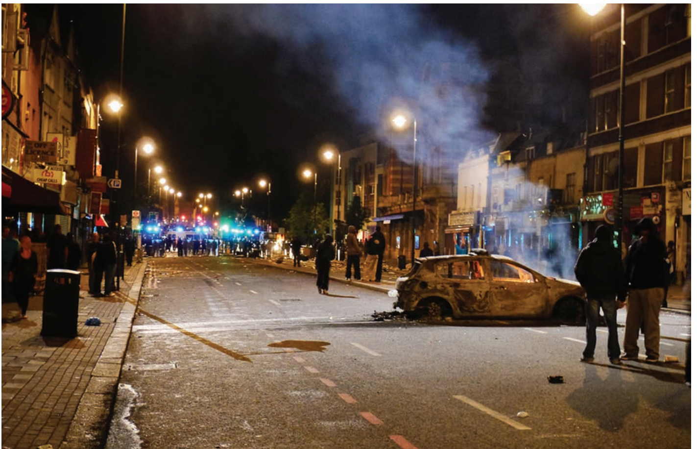
Aftermath of the riots in Tottenham on 12th August 2011 after police shot and killed Mark Duggan. The killing was to trigger riots in a number of cities around England for several days afterwards.