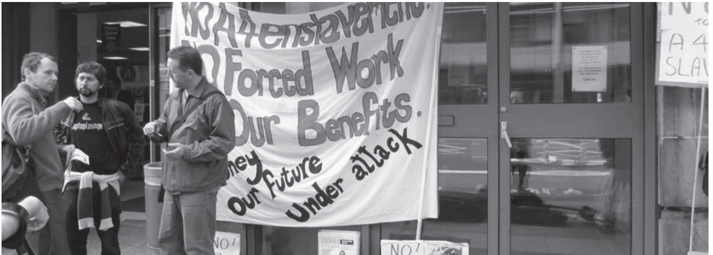
Edinburgh Coalition Against Poverty protest at A4e's Edinburgh offices at Earl Grey Street.