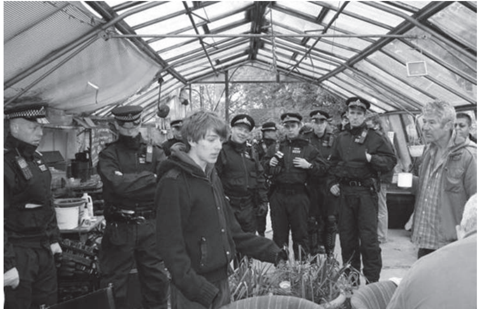
Above, the police raid Grow Heathrow; below, the front door at Offmarket was smashed, but the space has now re-opened.

However, the cops will undoubtedly claim this model of preventative detention and raids was a success and seek to use it in the future. A dangerous precedent has been set