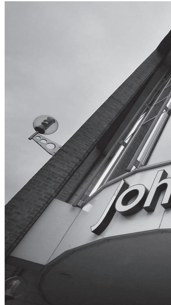
Should workers set up John Lewis-style co-operatives?

It should be noted that in 1999, in response to a fall in profits, some employees in John Lewis called for the business to be demutualised and floated on the stock market. Though this was rejected, the demutualising of the building societies under Thatcher should be a warning of where this can go (particularly as it eventually contributed to the current crisis). Significantly, Proudhon stressed that while