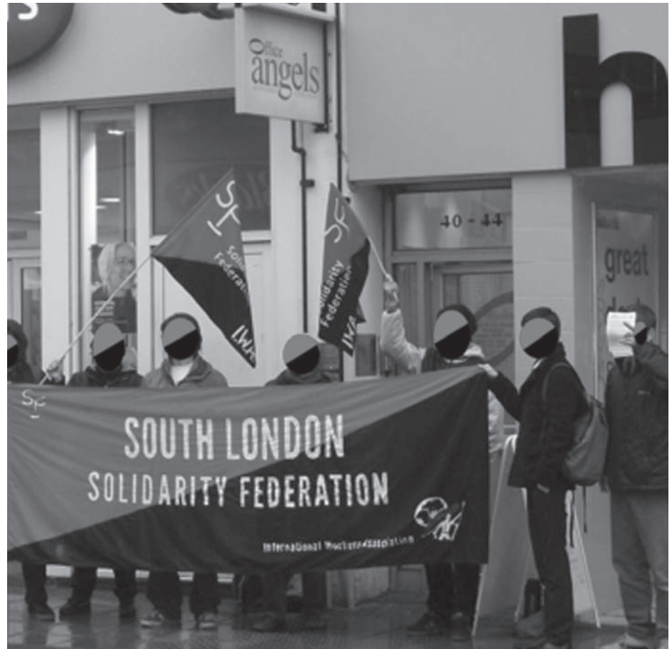
Solidarity Federation's initial picket at the Office Angels branch in Wimbledon, south west London, on 18th March 2011.

● Since March, Solidarity Federation has been involved in a campaign of action against Office Angels, a recruitment agency specialising in short-term temporary office placements, after an ex-employee asked for their assistance over a pay dispute. The person in question was assured by the company that the lack of a time-sheet would 'not be a problem' when confirming his work record. However, they refused to pay him the wages he was owed – falsely claiming he only worked for one day, despite evidence to the contrary.