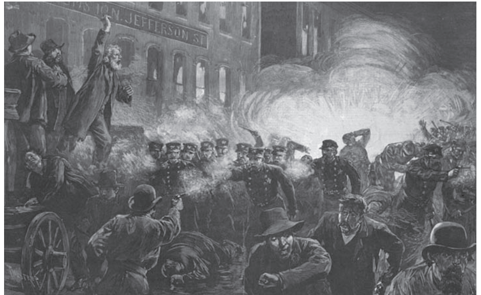
An unknown person throws a dynamite bomb at police, Haymarket Square, Chicago, 1886.

During the three years prior to Haymarket, the International 1 published no fewer than fourteen journals, daily, weekly, fortnightly, which acquainted a growing number of workers with socialist and anarchist ideas. By far the most important were Most’s Freiheit , Spies’s Arbeiter-Zeitung , and Parson’s Alarm . All these journals, in whatever language they were published, trumpeted revolutionary methods and goals. All, moreover, used the term ‘anarchist’ to characterise their political beliefs. Initially, as Parsons relates, the anarchist label had been fastened upon the Internationalists by their opponents, who had sought to stigmatise them as enemies of