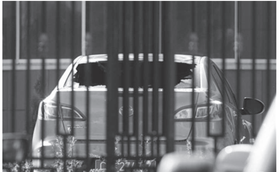
Fire bombs were thrown at the Russian embassy in the capital of Belarus, Minsk, damaging a car parked there in 2010.

That's why Belarus Anarchist Black Cross call all concerned people to make protest actions on 12th to 15th May against unfair accusations and solidarity actions with the Belarusian anarchists. They welcome solidarity actions of any kind as well as other actions aimed at spreading information about the situation with political repression in Belarus and involving local human rights advocates in bringing up the problem about prosecutions in Belarus.