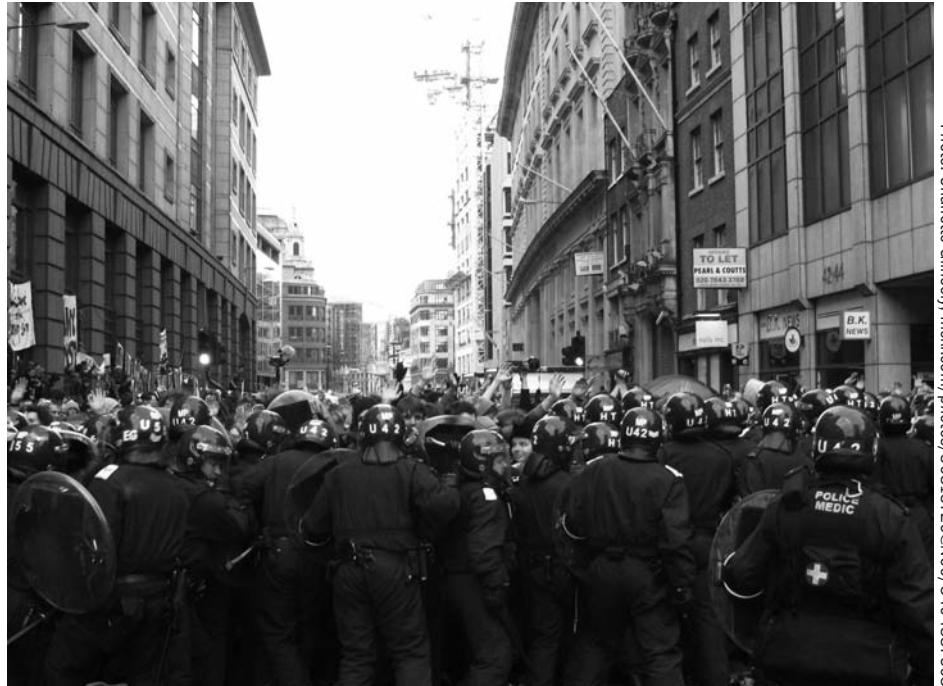
Police 'kettle' protesters at the G20 Climate Camp on Bishopsgate, London, 1st April 2009.

If you are the driver of any vehicle, including pedal cycles, you can be required to give your