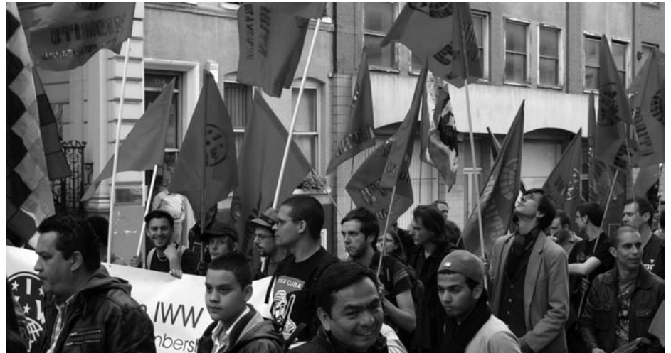
London IWW and IU640 at the Mayday Parade in 2010.

The IWW prides itself that it is wholly worker-focused. While individual members may belong to a political party (or indeed another Union with political affiliations) the IWW has no party line. As we are outside the TUC we have a minimal bureaucracy; there are no paid positions in the IWW. We are run solely by activist members on a voluntary basis, and many of the administrative positions have a given time limit for any individual post holder. We are a fighting Union, and the majority of the membership dues are spent on campaigning and casework. As might be imagined this is an attractive proposition for many activists who have been frustrated by the seeming inactivity or slow top-heavy bureaucracies in many of the UK's larger Unions. Unsurprisingly, we have recently had major increases in membership for exactly these reasons, including our IU640 'Cleaners' Branch which disaffiliated itself from a major TUC Union to join the IWW en masse after the UBS 'Justice for Cleaners' campaign in 2010.