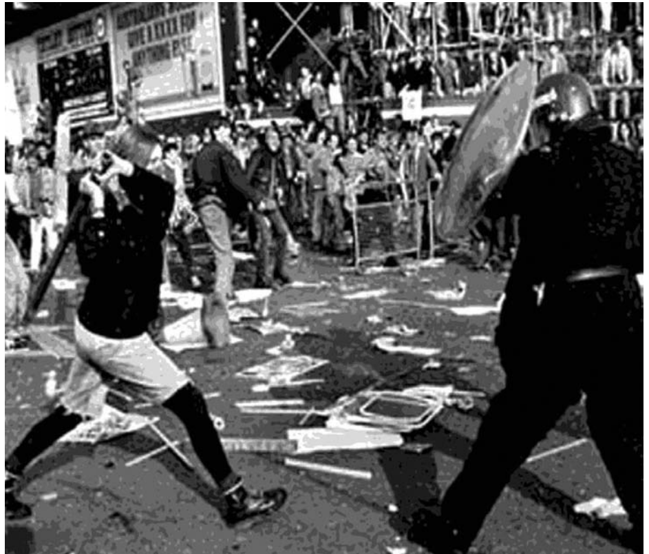
WAG's latest publication On The Streets contrasts the Poll Tax Riots, pictured above, with Stop the War.

The tabloid press continues to mine the rich seam of prisoner-baiting opened up to them by the New Year's Day riot at Ford open prison. The funniest recent article is by The Sun's 'crime editor'. This rather shifty looking character apparently smuggled himself into Ford one morning at dawn, where he allegedly persuaded a prisoner to photograph said reporter in front of a stash of alcohol, cannabis and a mobile phone, all on the prisoner's own mobile. Needless to say, the posed photos taken by The Sun's own photographer outside Ford look exactly the same as those supposedly taken inside the prison by prisoners. What a con!