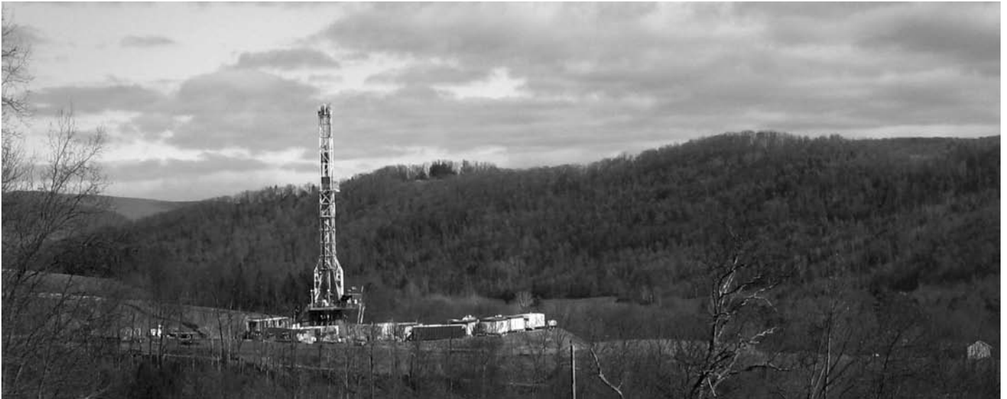
Tower for drilling horizontally into the Marcellus shale formation for natural gas, just north of Pennsylvania in the USA.