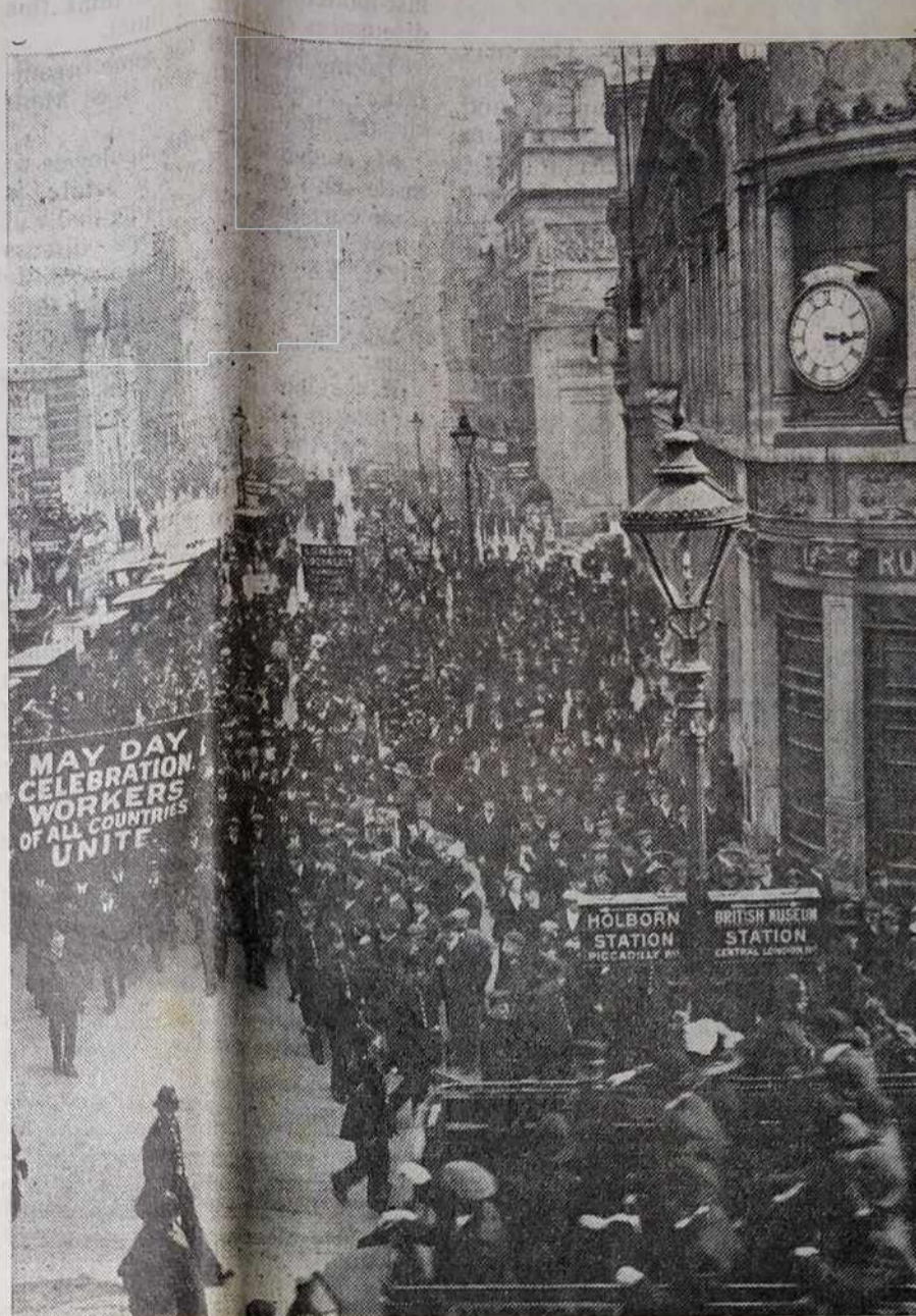
MAY DAY 1912

This procedure was put into effect the following year and, after several years of struggle, the eight-hour day was won. But the victory was neither cheap nor easy. In France, in 1890, there were serious clashes with the police, resulting in injury and arrest for many workers. In the following year, an eighteen-year-old girl was shot dead by soldiers hired by the management of a factory at Fourmies. In the same year there were widespread riots in Italy which were violently and brutally suppressed, and the Belgian miners, lacking the support of the rest of the country, slumped to a bitter and costly defeat. In 1892, there were great strikes in Russia and Poland, especially at Warsaw, and at Lodz, where the strikers were shot down in large numbers by Cossacks. And so the fight continued, with incident following incident. It would take too long to enumerate fully the blows inflicted on the Labour movement before their ultimate victory. And even then for many it was a hollow victory, more of a failure than a success. To be sure the eight-hour day