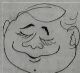
He's already bought his tickets.....