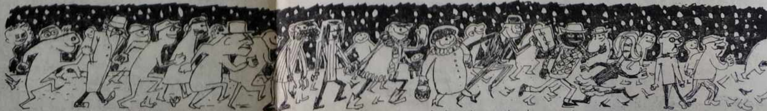
They are all running to buy their tickets for the Anarchist Ball . . . . . it's the only way they know to keep warm . . . . .

17a MAXWELL ROAD FULHAM SW6 Tel: REN 3736