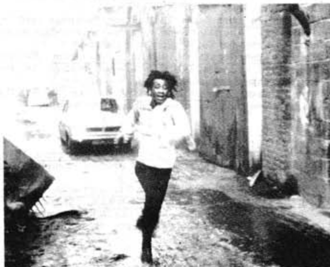
Blue, the main character, being chased by the police