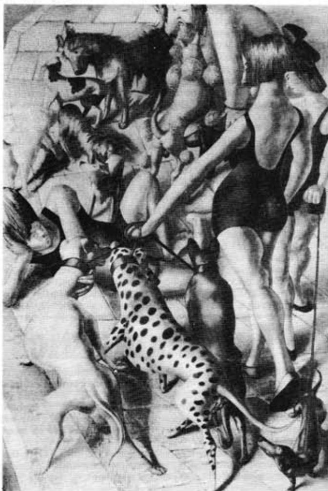
'The Bathing Pool Dogs' by Stanley Spencer