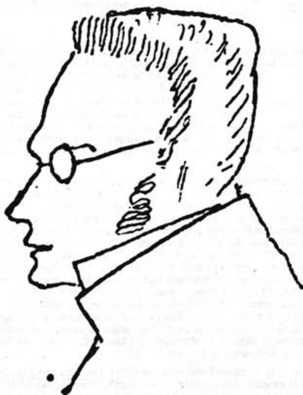
Pencil sketch of Max Stirner Drawn after his death from memory by Engels

Every state is a despotism , be the despot one or many, or (as one is likely to imagine about a republic) if all be lords, -- i. e. despotise over one another. For this is the case where the law given at any time, the expressed volition of (it may be) a popular assembly, is thenceforth to be law for the individual, to which obedience is due from him, or towards which he has the duty of obedience . If one were even to conceive the case that every individual in the people had expressed the same will, and hereby a complete "collective will" had come into being, the matter would still remain the same. Would I not be bound today and henceforth to my will of yesterday? My will in this case would be frozen. Wretched stability! My creature -- to wit a particular expression of will -- would have become my