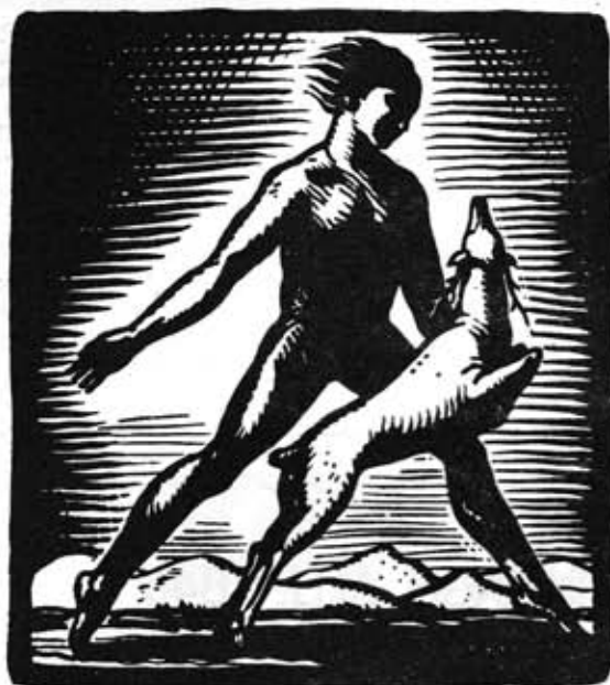
Emblem of the Modern School Association, designed by Rockwell Kent in 1917.