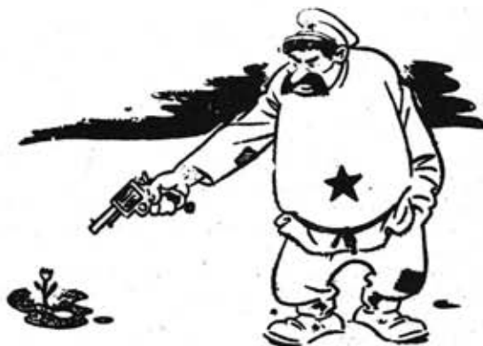
The Rebirth of Spring'

The Russian revolution was at the forefront of a revolutionary wave that swept the world. The appearance of workers' councils (soviets) provided a framework for the self-organisation of the working classes. From the outset they had to overcome the limitations of the mensheviks. The bolsheviks put out the slogan, 'All power to the soviets.' to ease out