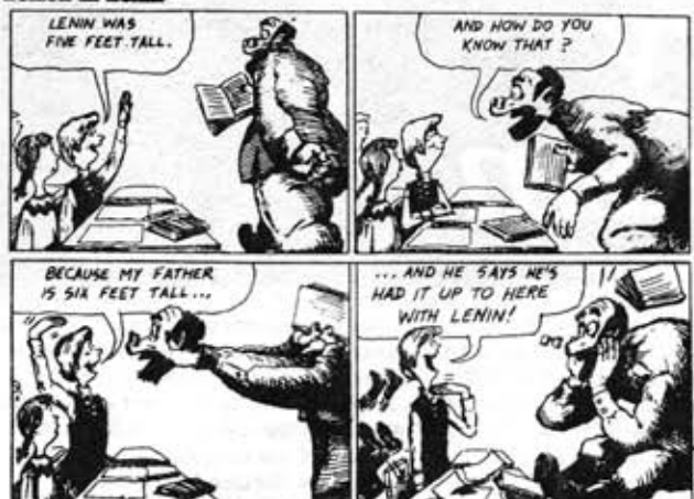
This cartoon is an example of current Polish political humor—30% of which is aimed against the Russians and perhaps another 10% against Polish subservience to the Soviets.

be done. The secretariat of the IWMA, however, imposed the condition that the choice of titles for publications should be made in consultation with itself, which would have meant that all the pamphlets would by necessity have been of an anarcho-syndicalist complexion. The group, on the other hand, demanded complete autonomy but gave an undertaking that international literature on syndicalism would be published at regular intervals. Since these transactions were conducted through written channels, and indirect ones at that, no result was forthcoming.