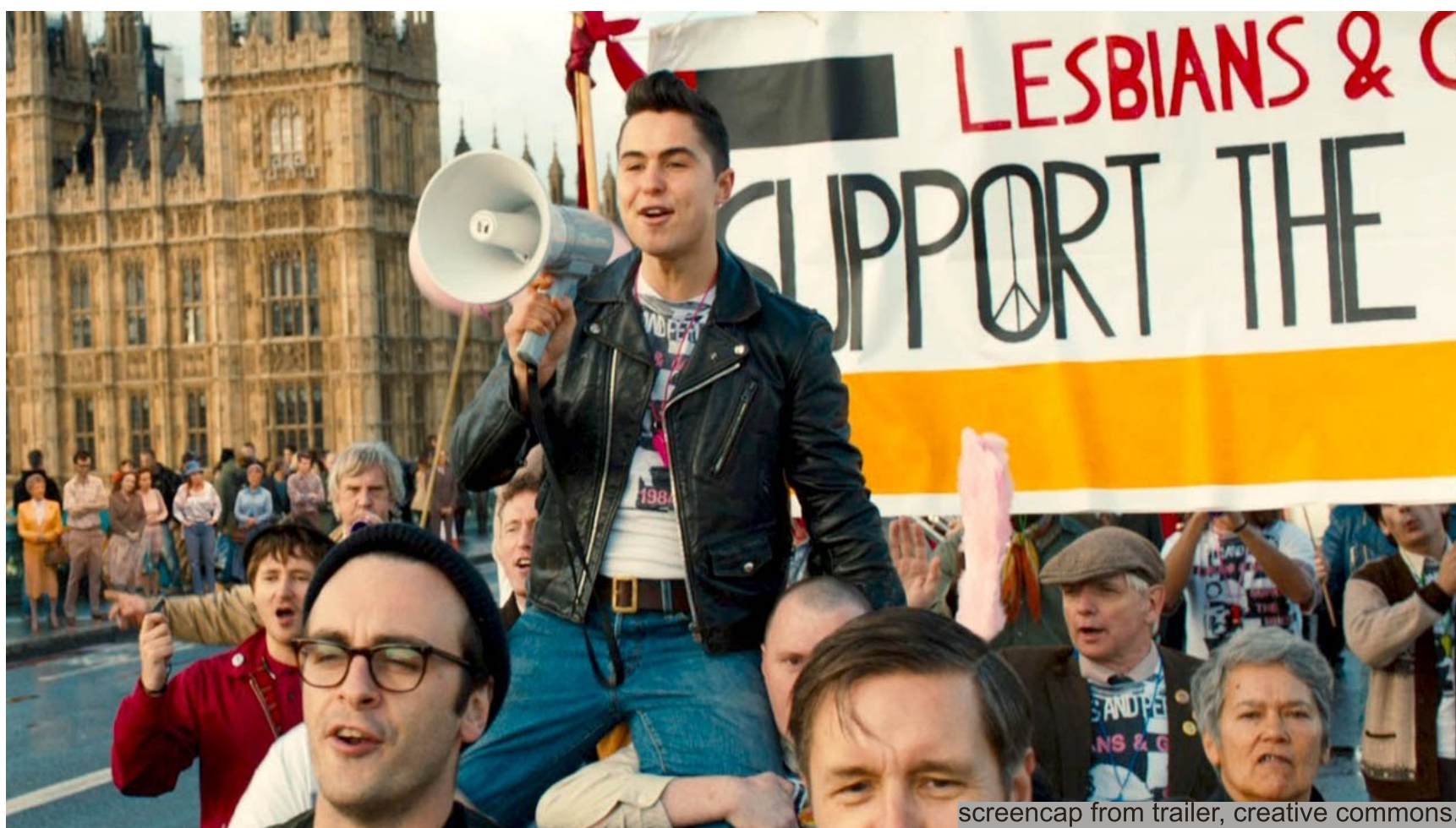
screenshot from trailer, creative commons.

I went to see the film in Leicester Square, where at the end there was spontaneous applause. Afterwards I had a look on social media to see what other people thought of the film and one commenter had posted that it made them feel nostalgic for a time they hadn't known. While in no way wanting to question this person's experience or self diagnosis I wonder if they were really experiencing 'nostalgia'. Nostalgia is a looking back to something that 'was', it can easily be impotent. My own experience watching the film was that it evoked a sense of yearning; for community,