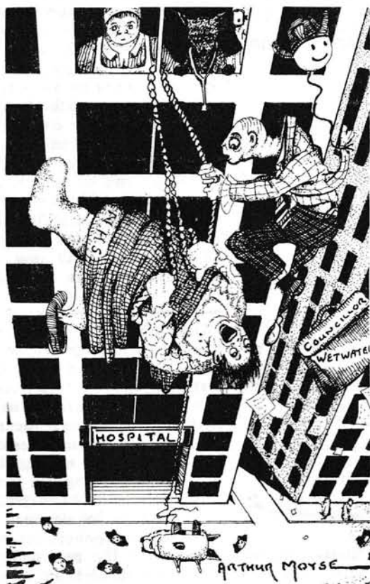
'We told you, only six pickets.'