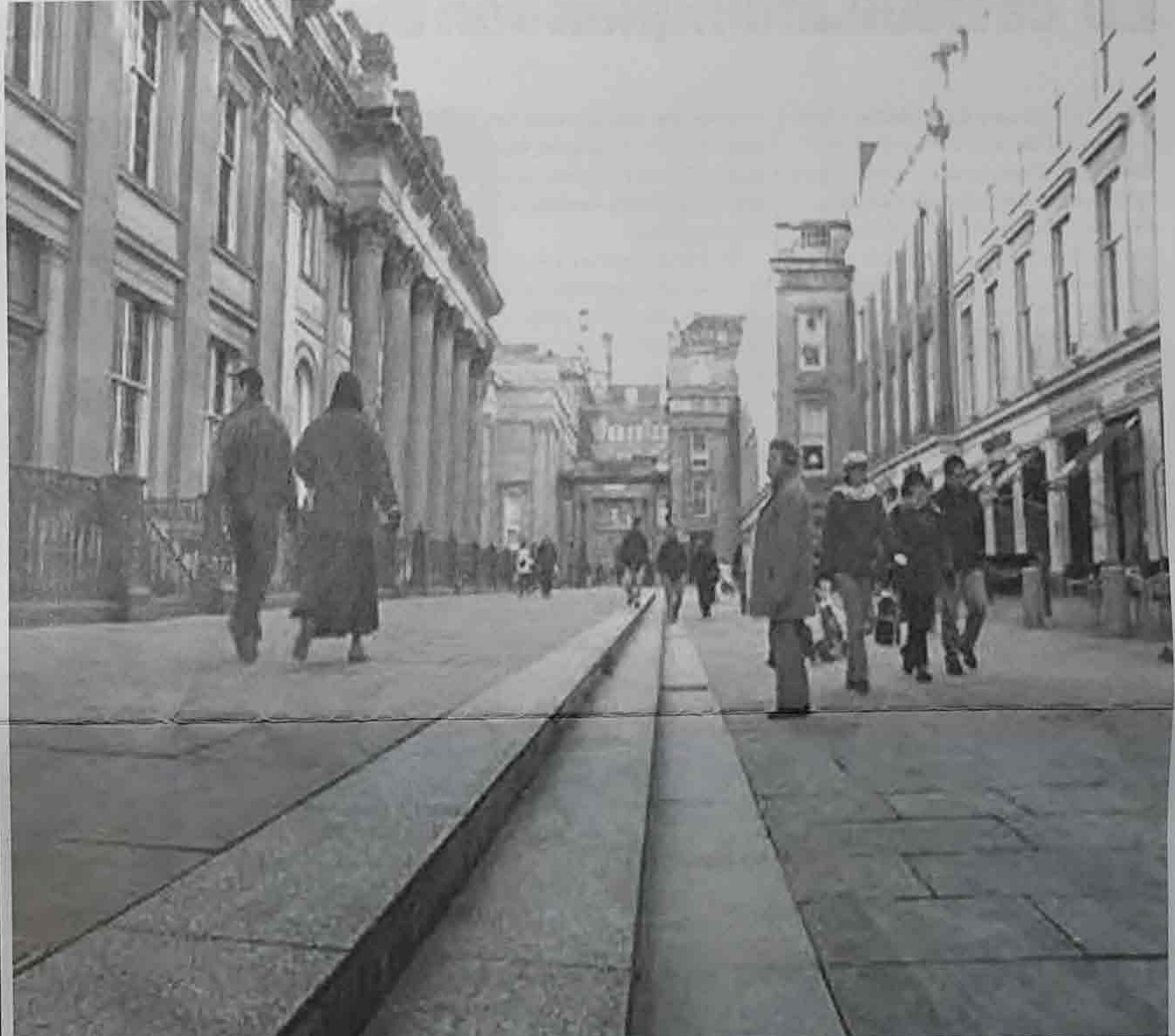
Royal Exchange Square in Glasgow's city centre

A study has been set up to determine why the life expectancy figures are so low in the city, which will cost £250,000.