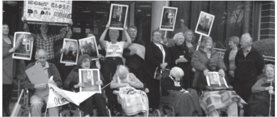
Protest at NHS Sheffield against the closure of Birch Avenue and Woodland View care homes.

For example, HMP/YOI Moorland and Hatfield were the scene of last year's three days of rioting sparked by bad staff-inmate relations and heavy use of force in a rundown, shabby and poorly organised prison. They, together with nearby HMP Lindholme, are ripe for a Yorkshire-based prison cluster; as are HMP Acklington and HMYOI Castington (along with their feeder prison at Durham) in Northumberland's case. Castington interestingly is itself notorious as the prison where 10 children and young adults (15-21 years) were, over a two-year period, hospitalised with broken bones after being restrained by officers. Four of the jails also happen to be Category C training prisons, the very institutions at the forefront of plans to introduce a new Victorian working ethic into prisons. No doubt the plan here is to use the private sector to build much-needed new workshops and introduce the sort of changes to prison regimes impossible to achieve in the public sector, where the POA still hold sway.