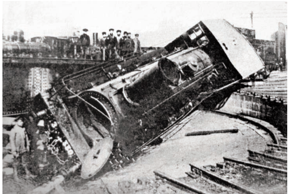
The 1905 Russian revolution was one of the topics discussed at the 1907 International Anarchist Conference. Here a train has been overturned by strikers at a railway depot during the general strike by Russian workers in 1905.

A hundred years later it is fair to say that Malatesta was correct in his critique of syndicalism. Few syndicalists today would disagree with Malatesta on the need to turn a general strike into an insurrection, and the