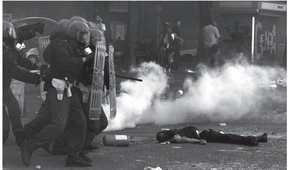
Riot police storm past the body of Carlo Giuliani, who had been shot and killed in central Genoa during the G8 Summit protests, 20th July 2001.

And then the gas canisters fell from the sky. No warning, no police in sight, just out of the blue... onto an unsuspecting crowd, many of whom did not actually have masks or protection – and of those that did, most were not wearing them. It was mayhem. Crowds streaming backwards (literally! – carried by the water from their eyes), reinforcements continually trying to get to the front. Vinegar was quickly used up in dousing