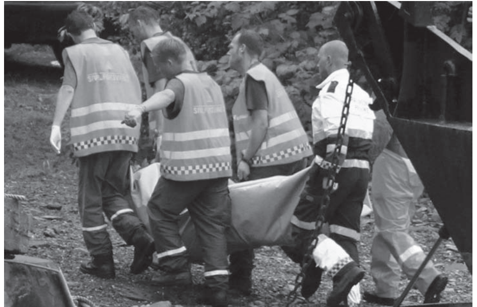
Above, rescue teams carry the body of a victim from Utoeya island; below, the aftermath of the Oslo bomb.

There appears to be reluctance in the immediate coverage following the Norway bombing and shooting to call him for what he