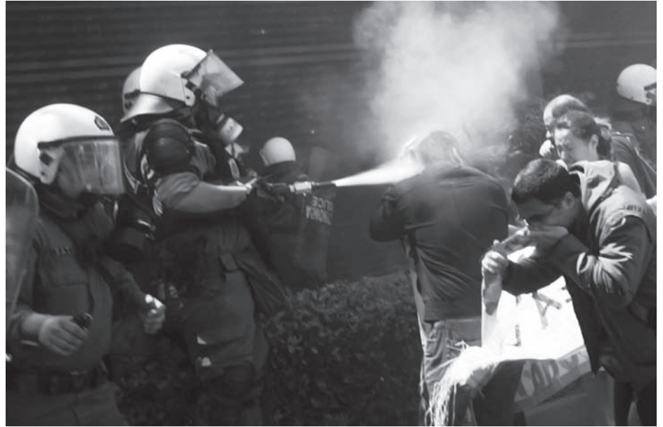
A riot cop sprays tear gas at a protestor's head during clashes Athens on 11th May 2011.

The following day in the early hours, a 21-year old Bangladeshi migrant was stabbed to death in the Kato Patisia district of Athens by fascist thugs who had launched a series of attacks in this largely immigrant area following the killing of Greek man on 10th May. Fascists, under the protection of the police, roamed through central Athens indiscriminately attacking immigrants, smashing cars and in one case firebombing a family home. At least fifteen people were