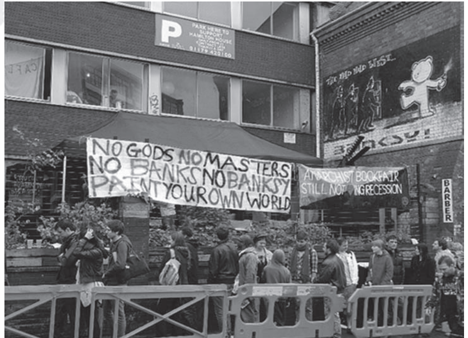
Outside the Bristol anarchist bookfair on 7th May.

Once again the sun shone, for most of the day at least, bringing an at times festival-like feeling to the serious business of resisting the onslaught of the ConDem Coalitions vicious attacks on the working class and creating real alternatives to the chaos and destruction of capitalism. The decent weather alongside the hot topics up for debate and the growing anger at the inequalities inherent in the failing system around us combined to see the building near to overheating. But the genuine sense of co-operation amongst visitors and organisers of the events ensured a fairly smooth running day was once again a good example of anarchism in practice. Of course there are always some minor problems, such