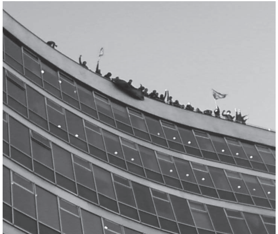
Protesters occupying the roof of 30 Millbank in Westminster, campaign headquarters of the Conservative Party, on 10th November 2010.

● The legal defence support group Green and Black Cross is busy preparing its first national network gathering. The group, made up largely of anarchists and old climate camp activists, came to prominence during the student protests last November when they set up a network of support for those arrested for occupying the Millbank Tory HQ building. They have since become active in legal support for all those involved and affected by the unrest surrounding student protests and the anti-cuts initiatives. They have close working links with Legal Defence Monitoring Group, the anarchist organisation involved in providing legal observers to monitor police misconduct on demonstrations.