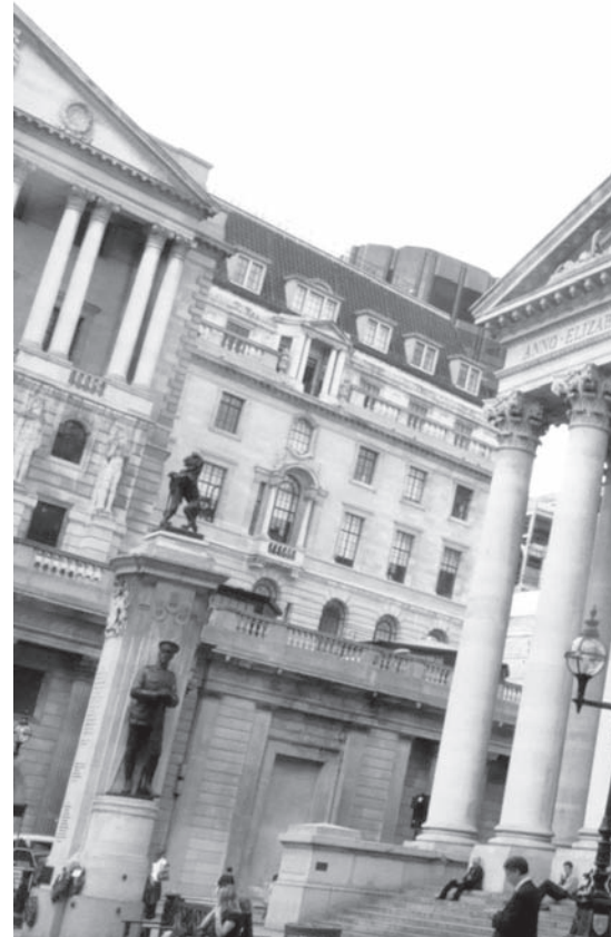
Above, the Bank of England building in London; below, the Bank of England and Chairman of the Monetary

Still, King expected growth to bounce back later in the year. Why this prediction should be any more accurate than the Bank's