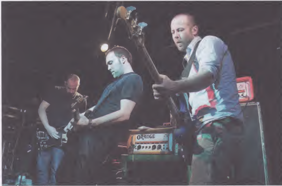
Mogwai at Royal Festival Hall, 25th January 2014

Seeing Mogwai 'from Glasgow, Scotland' on Burns Night was magic – although the Royal Festival Hall felt wrong for Mogwai. Everyone was behaving well in their seats