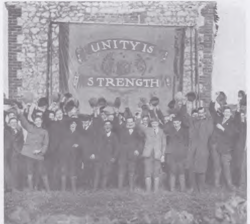
National Union of Agricultural Workers: West Norfolk labourers on strike, 1922.

The unions have little presence and even less response. There must be a better way? Even reformists must see that being reasonable doesn't work.