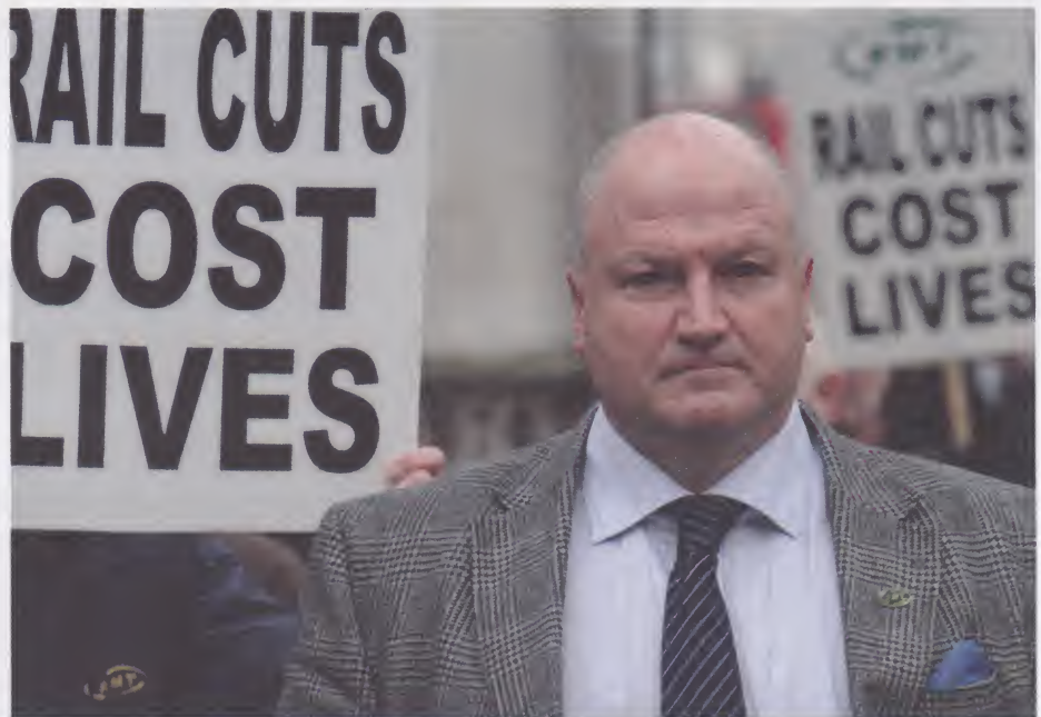
Rail, Maritime and Transport Union General Secretary Bob Crow died on 11th March at the age of 52.