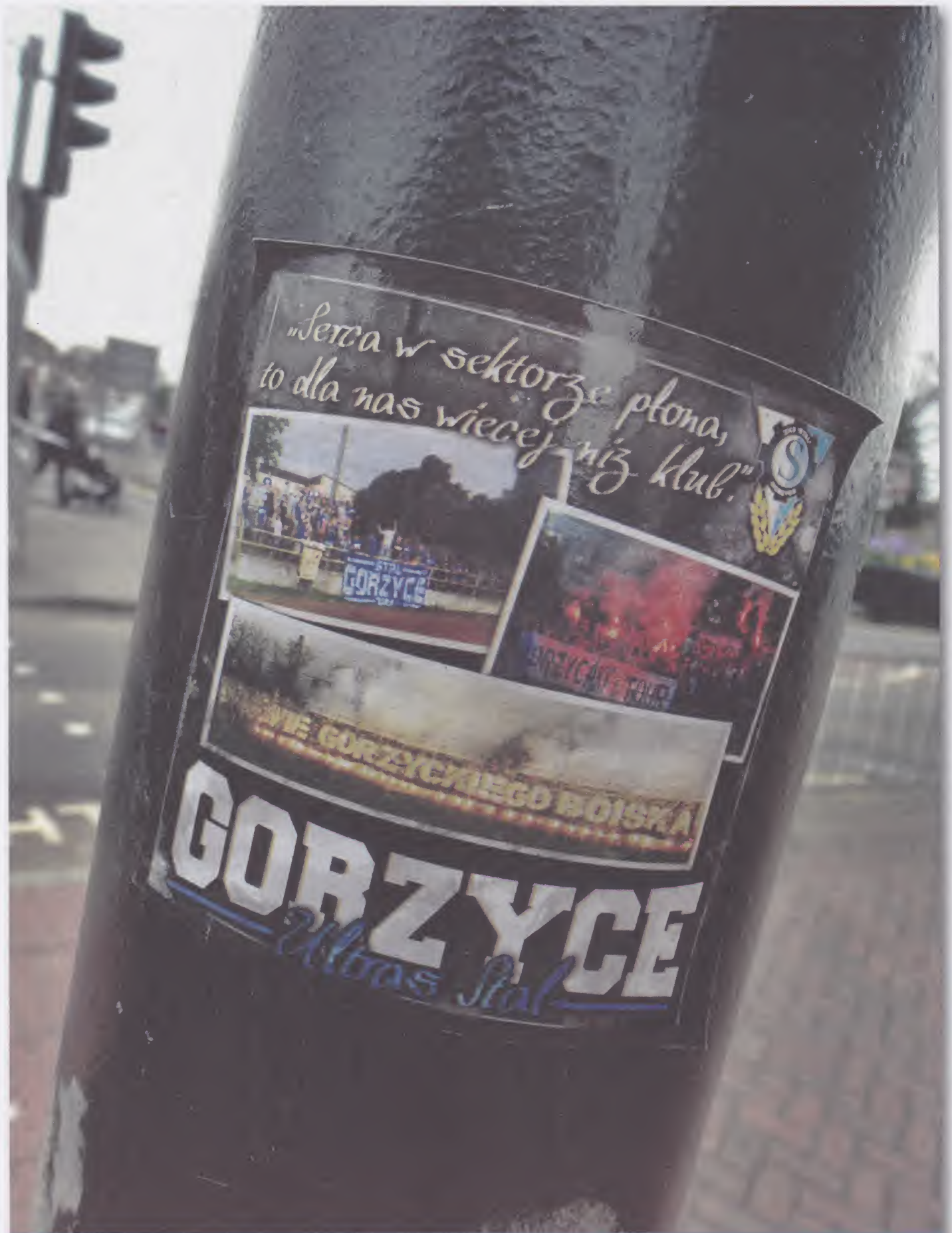
First published in 'The Heckler – Radical News and Views from Thurrock and Basildon', this photo shows fascist football stickers found dotted around the area ( http://southessexheckler.wordpress.com/ ).