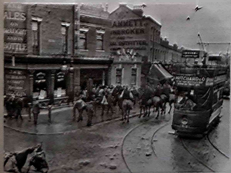
Street scene in Liverpool in July 1912

This affinative bond however was equal to the strength of the employers, coupled as it had been with the immediacy of the 'wildcat'. The employers may have gambled that the impact of the changes would take time to sink in, that the lack of organisation, etc. would give them time to get their ships away before unrest manifested itself, however the swiftness and directness of the men's response caught the masters and owners off guard and all shipping in the port became at once stranded.