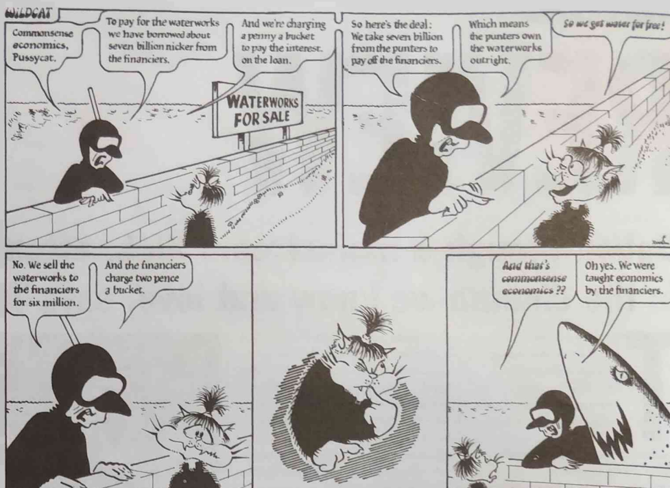
From Donald Roon's 'Wilder ABC of Boses' (Freedom Press, £3 post free)