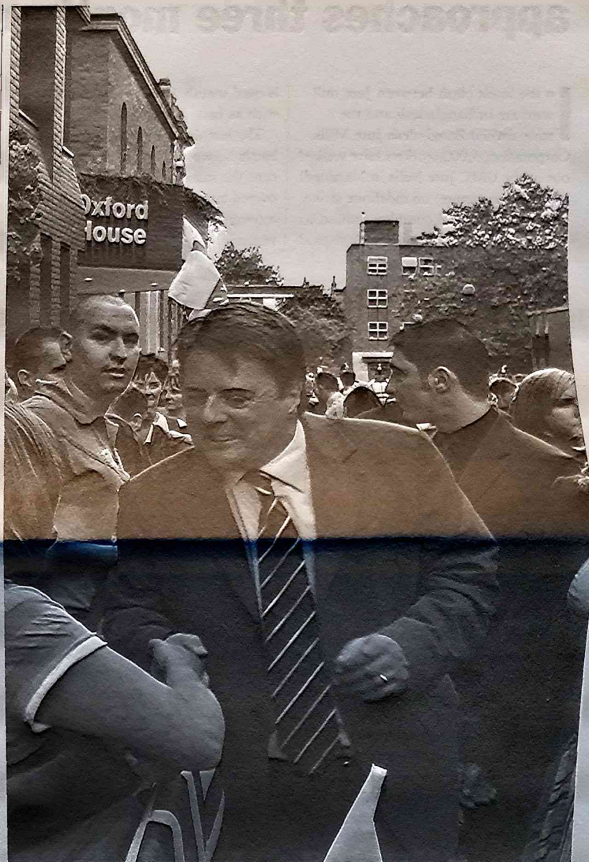
Nick Griffin meeting some of his supporters in Leeds, 2006

Go to antifa.org.uk for more information about anarchist activism against the BNP, or phone 07880 697 831.