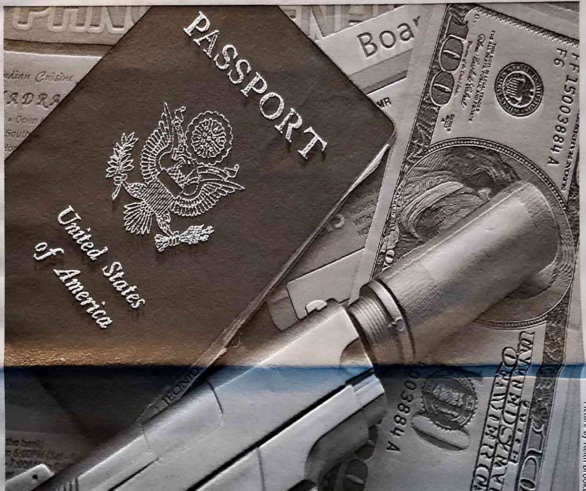
HIRED GUN: Mercenaries have updated for the new millennium

PMCs can also evade much political and legal oversight over their operations. Many armies are subject to highly