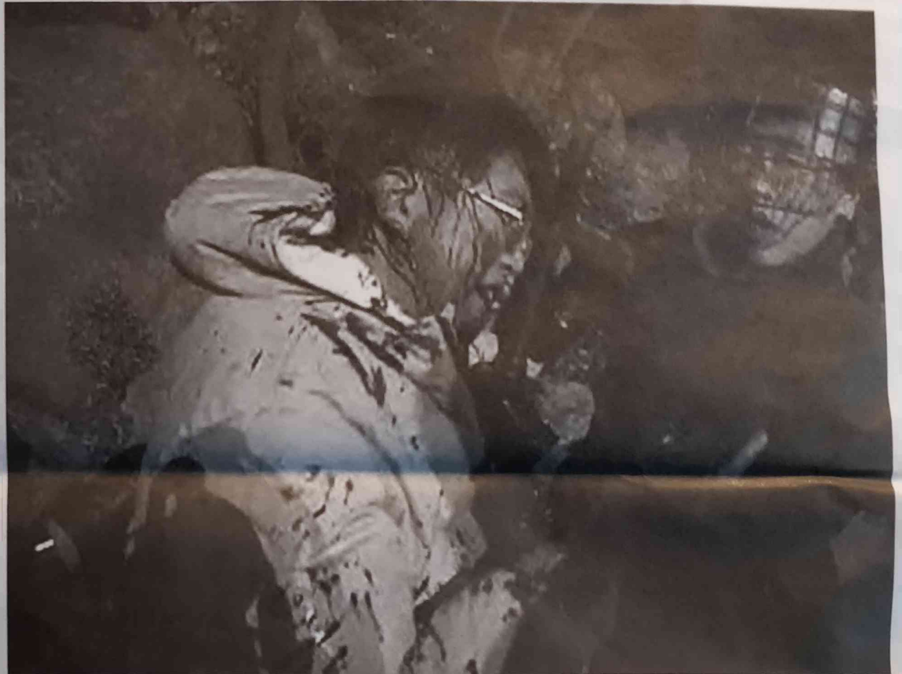
The Korean police have been particularly brutal

The KGEU had previously held a protest rally against the repression, with 7,000 demonstrating on 9th September in Changwon, Gyeongnam-do province, against a handful of office closures in late August. Police harassment of the march was extensive, with buses prevented from bringing delegates to