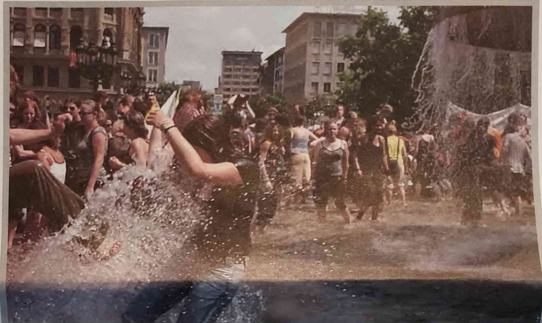
COOLING OFF: Demonstrators take a break as thousands of students march through Frankfurt in Germany. Events turned ugly shortly after this picture was taken, with riot police clubbing and spraying demonstrators, and 230 people were arrested, but later released without charge. The heavy-handed police approach was unexpected, as a 'hands-off' approach is more normal for student demonstrations. The march was held in protest at the city's introduction of tuition fees, following the success last year of conservative parliamentarians in overturning a legal ban on individual states introducing them. Frankfurt University now charges 15,000euros, not including living accommodation.

Most of the work in moving people from benefits into the workplace, it has emerged, will be made the responsibility of private agencies, with 60% of ESA support work allocated to the commercial sector. Much of the rest of the ESA scheme will also be contracted out, this time to NGOs or voluntary groups.