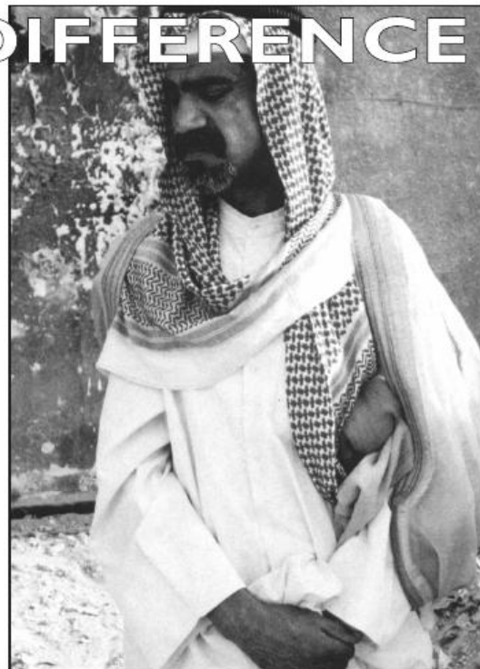
On 30th June British politicians voted to stop killing one of the above, just three months after they decided to start killing the other. And there's really not a lot we can say to that.