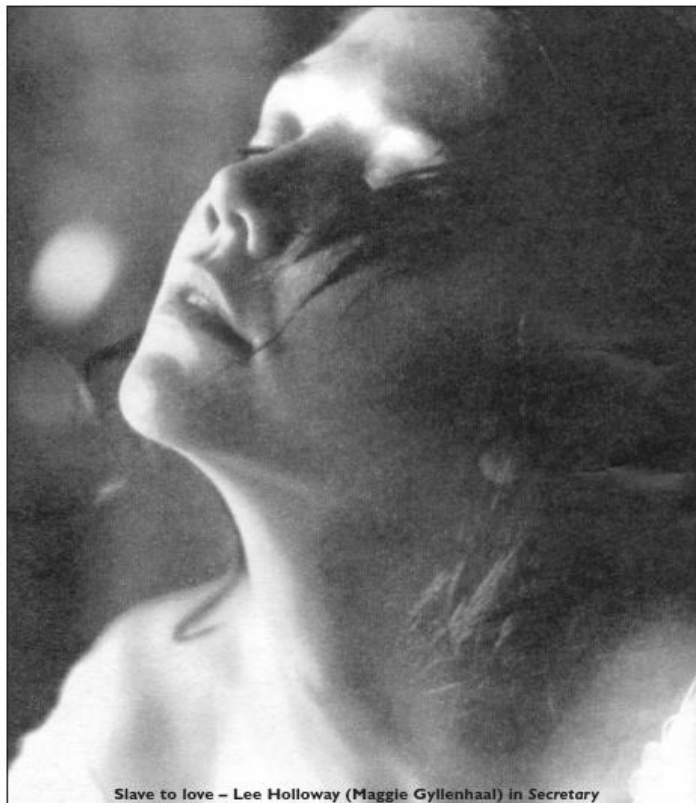
Slave to love – Lee Holloway (Maggie Gyllenhaal) in Secretary

She is from a dysfunctional family with an over-protective mother who doesn't allow her to grow up. The obsessively controlling Mr Grey is not really explained, apart from